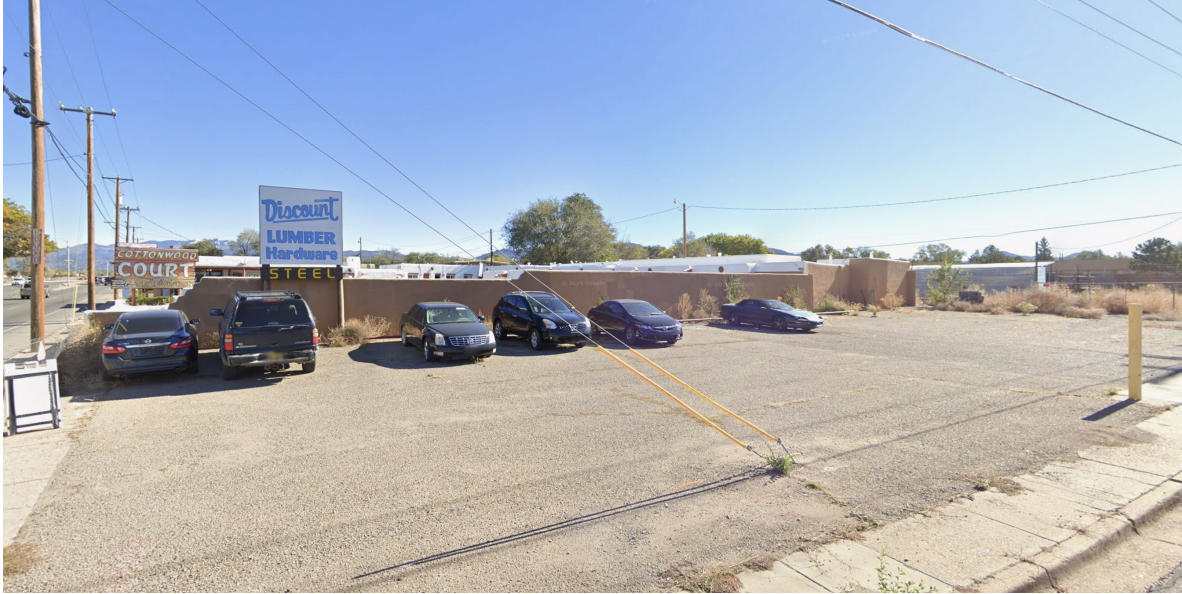
Western side of 1750 Cerrillos Rd property.