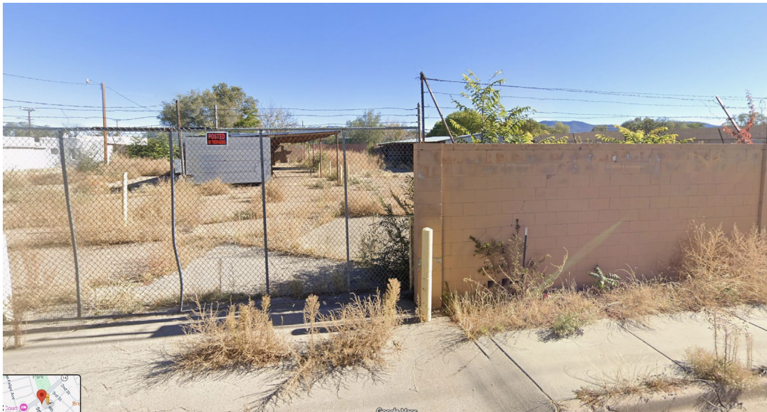
Western side of 1361 Fourth Street property.