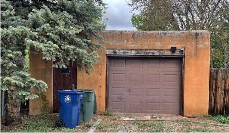
Figure 3: South Elevation of Accessory Structure