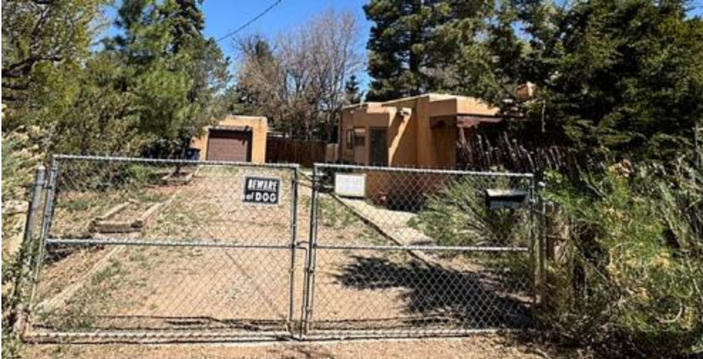
Figure 1: Property setting

The Spanish Pueblo Revival-style home was constructed in the 1940s using adobe as part of the Garcia family compound. A rear addition was constructed sometime between 1958 and 1966 (see aerials provided in 2025 HCPI) in a ranch style at a lower height than the original structure. After 1978, a bay window addition was constructed on the west elevation, along with two window opening changes. According to the 2025 Historic Cultural Properties Inventory (HCPI), the south elevation porch appears to have been reconstructed at an unknown date due to the types of materials used in the construction, including milled plates and precut corbels. The windows are a combination of wood, aluminum, and vinyl. The residence is one of the original homes located in the Jose Dolores Garcia Estate Subdivision (lot 2), which was developed to accommodate Garcia family members from land deeded from the Garcia family ranch.