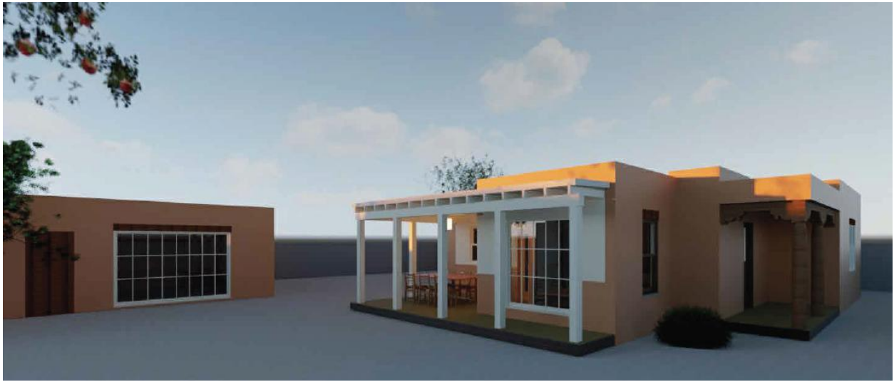
Figure 6: Rendering of requested remodels