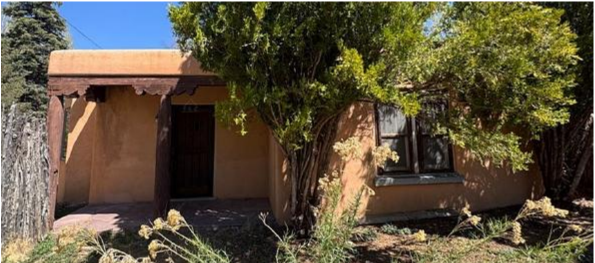
Figure 2: South Elevation of Residential Structure

The Spanish Pueblo Revival-style home was constructed in the 1940s using adobe as part of the Garcia family compound. A rear addition was constructed sometime between 1958 and 1966 (see aerials provided in 2025 HCPI) in a ranch style at a lower height than the original structure. After 1978, a bay window addition was constructed on the west elevation, along with two window opening changes. According to the 2025 Historic Cultural Properties Inventory (HCPI), the south elevation porch appears to have been reconstructed at an unknown date due to the types of materials used in the construction, including milled plates and precut corbels. The windows are a combination of wood, aluminum, and vinyl. The residence is one of the original homes located in the Jose Dolores Garcia Estate Subdivision (lot 2), which was developed to accommodate Garcia family members from land deeded from the Garcia family ranch.