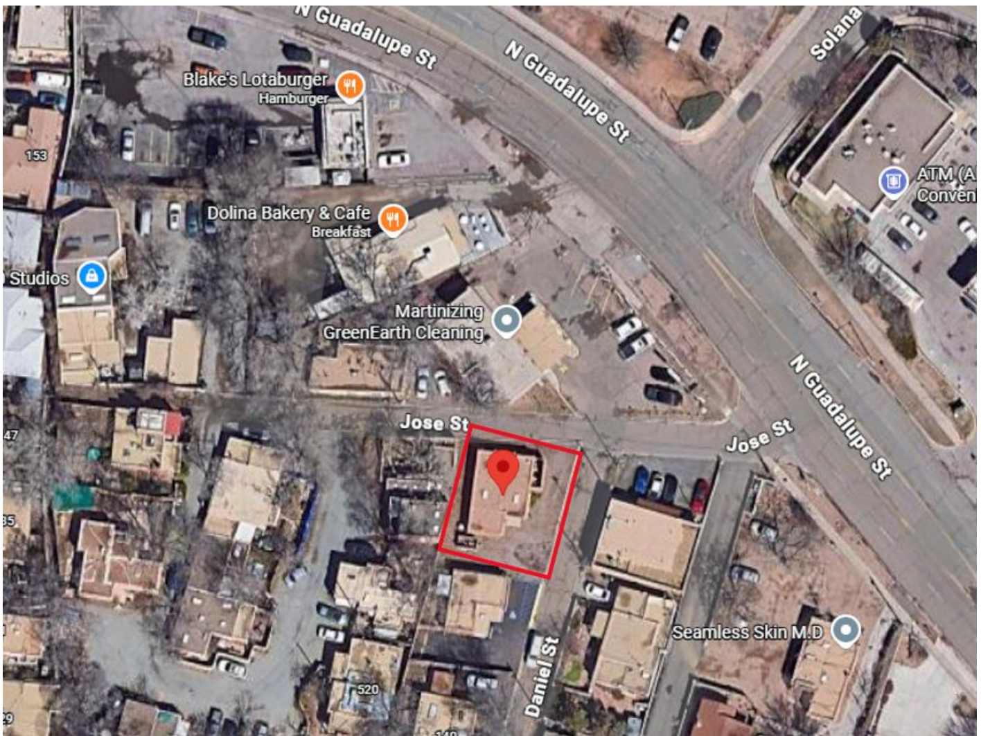
Figure 1: Property Location