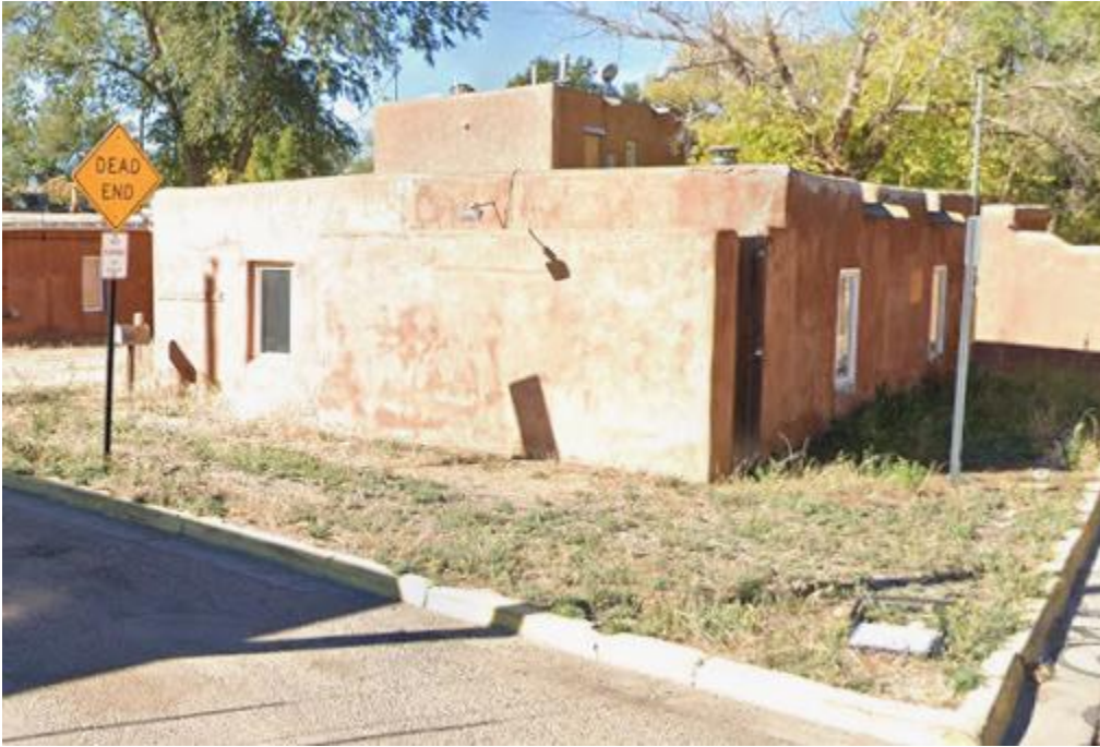
Figure 2: Streetview of Property