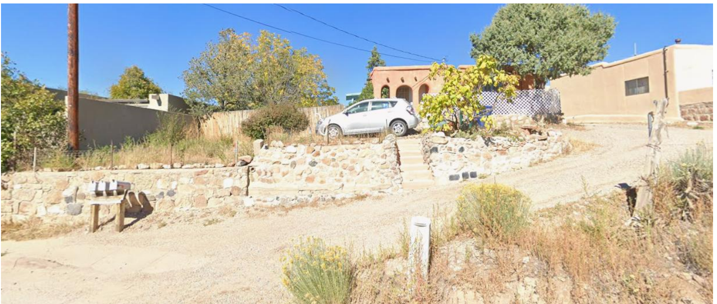
Figure 2: Street View of Property showing the retaining walls

The residence started as two connected rooms, but is now 1,030 sq. ft, excluding the two portals. The south façade features an arched porch entry and wood casement windows and appears to retain its original configuration. There was an addition of two rooms in the 1930s, which created a bump-out at the northeast corner. The garage and attached shed were demolished in 1995. In 1996, the structure was 927 sq. ft. when a room addition was placed on the north elevation, alteration of the west elevation portal, and other changes were made.