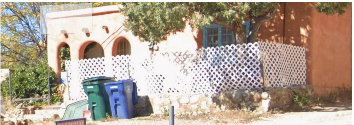
Figure 3: Low Planters