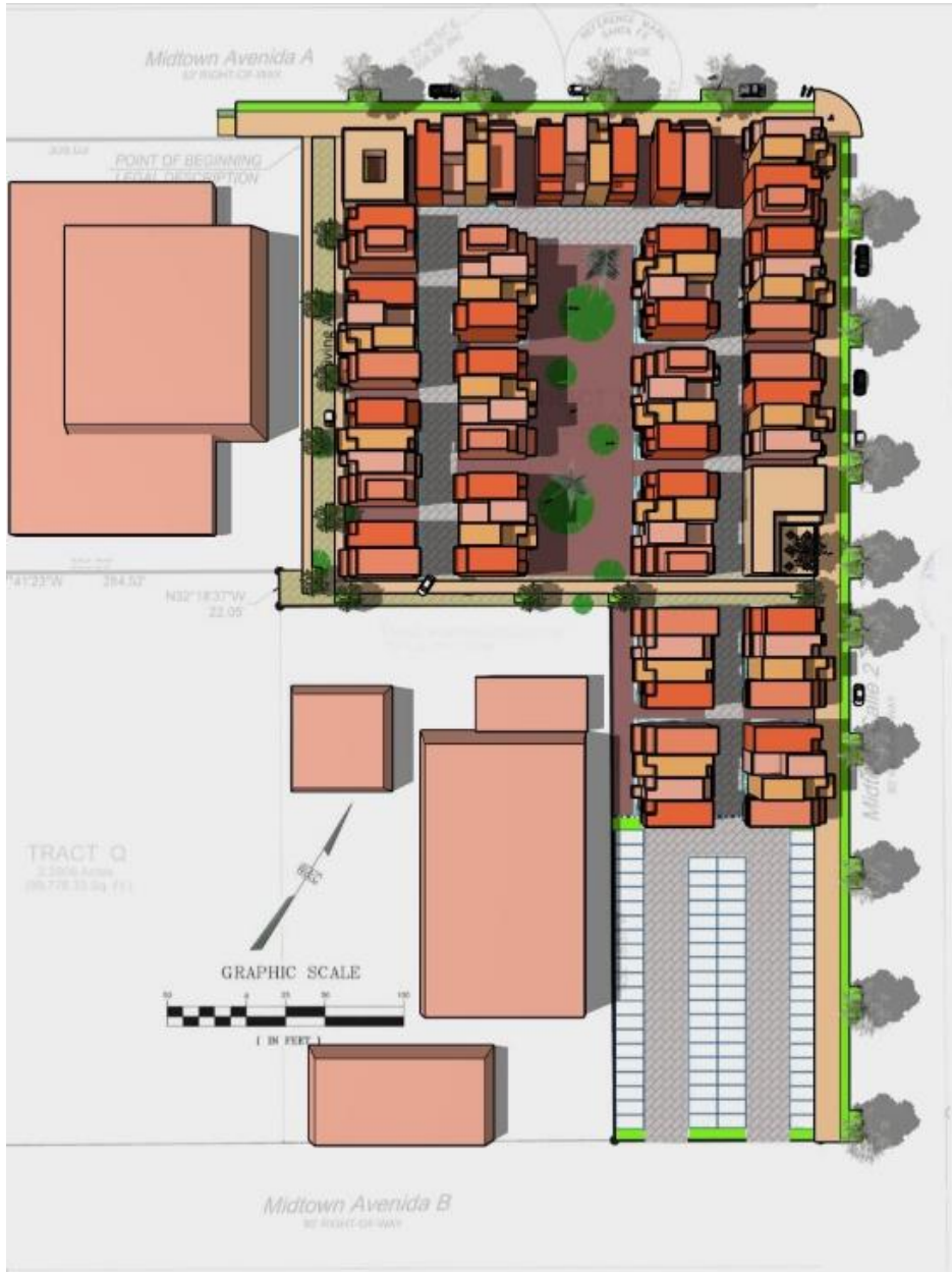
Exhibit A - Site Plan