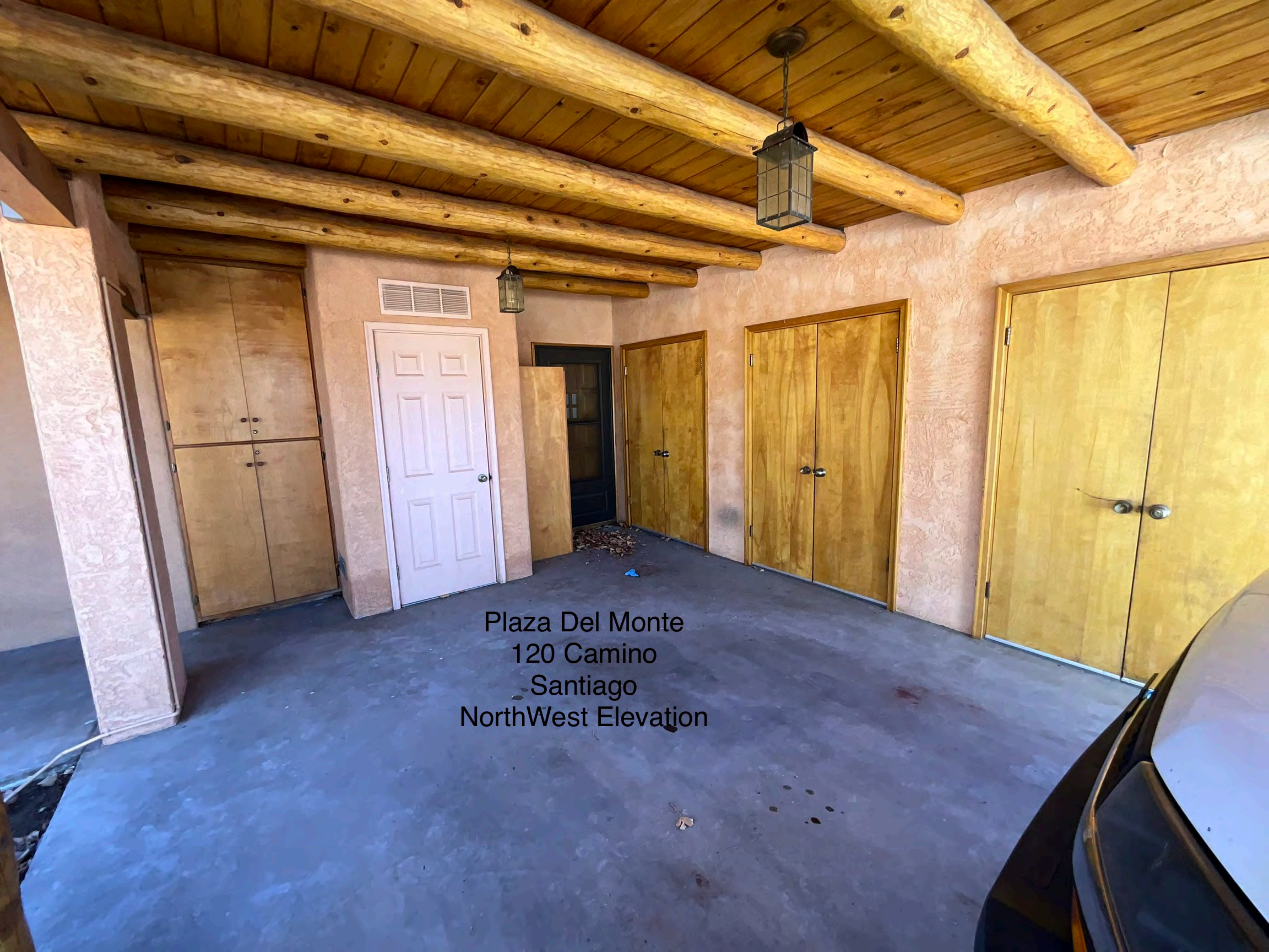
Plaza Del Monte 120 Camino Santiago NorthWest Elevation