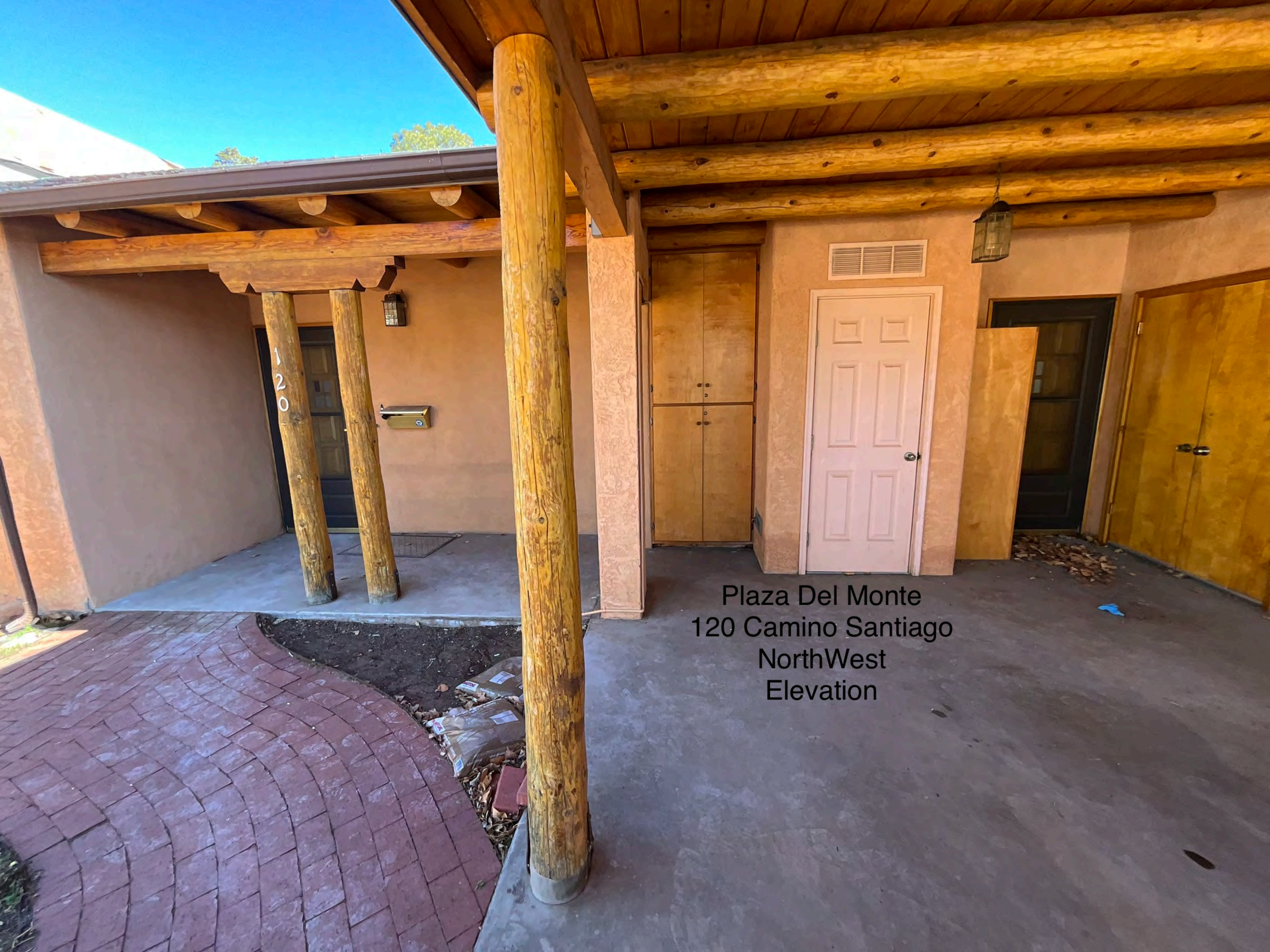
Plaza Del Monte 120 Camino Santiago NorthWest Elevation