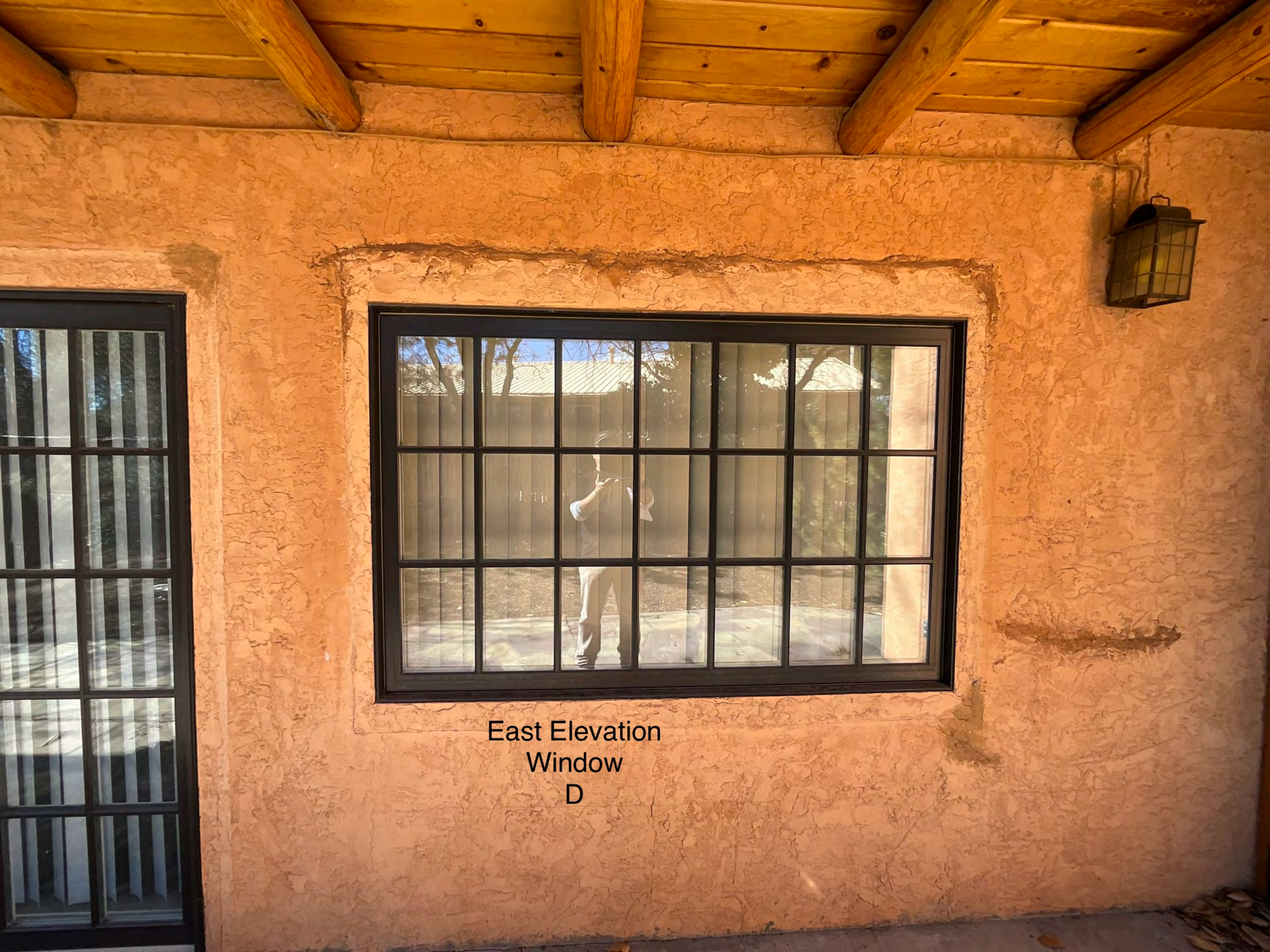
East Elevation Window D