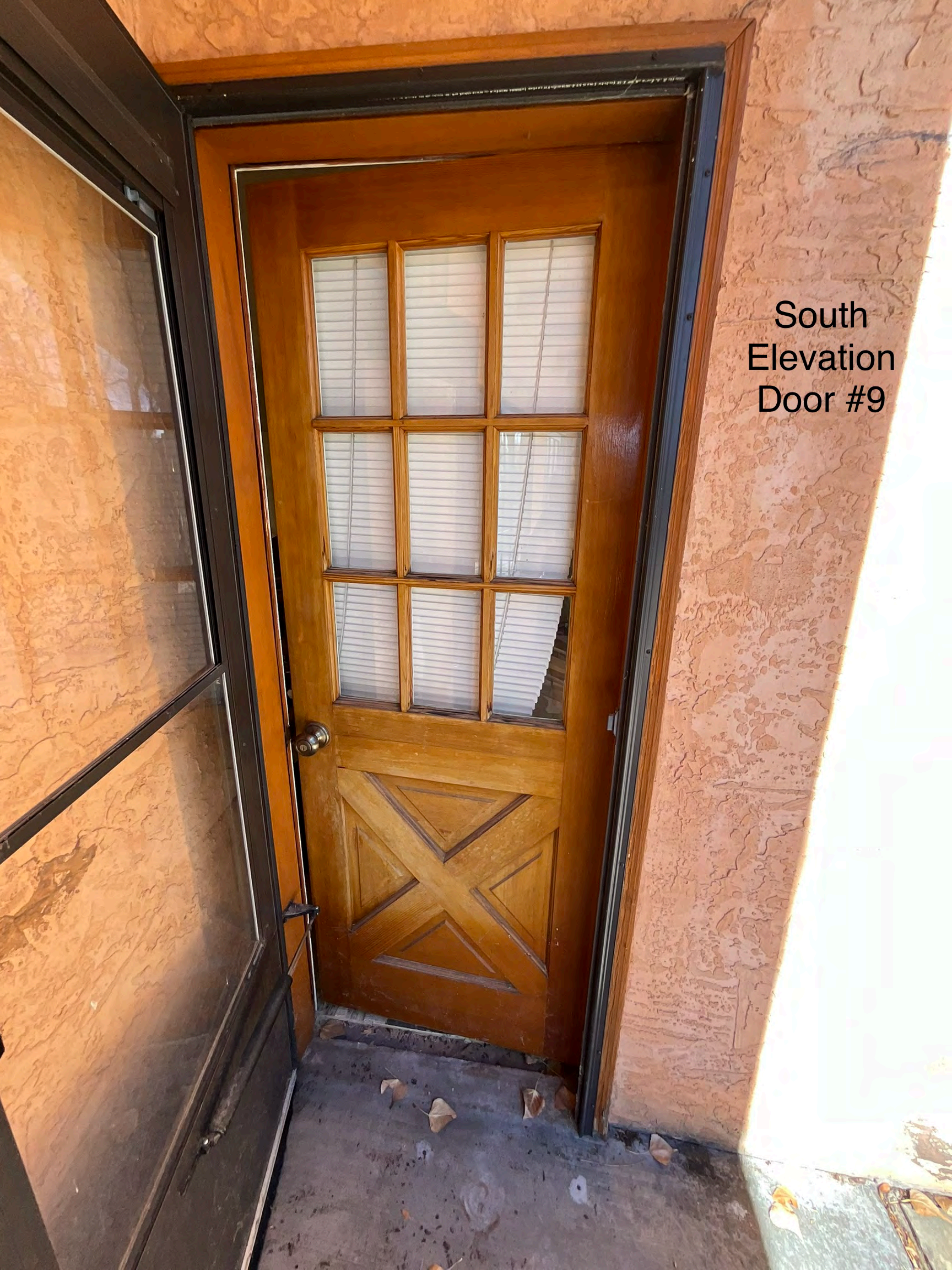
South Elevation Door #9