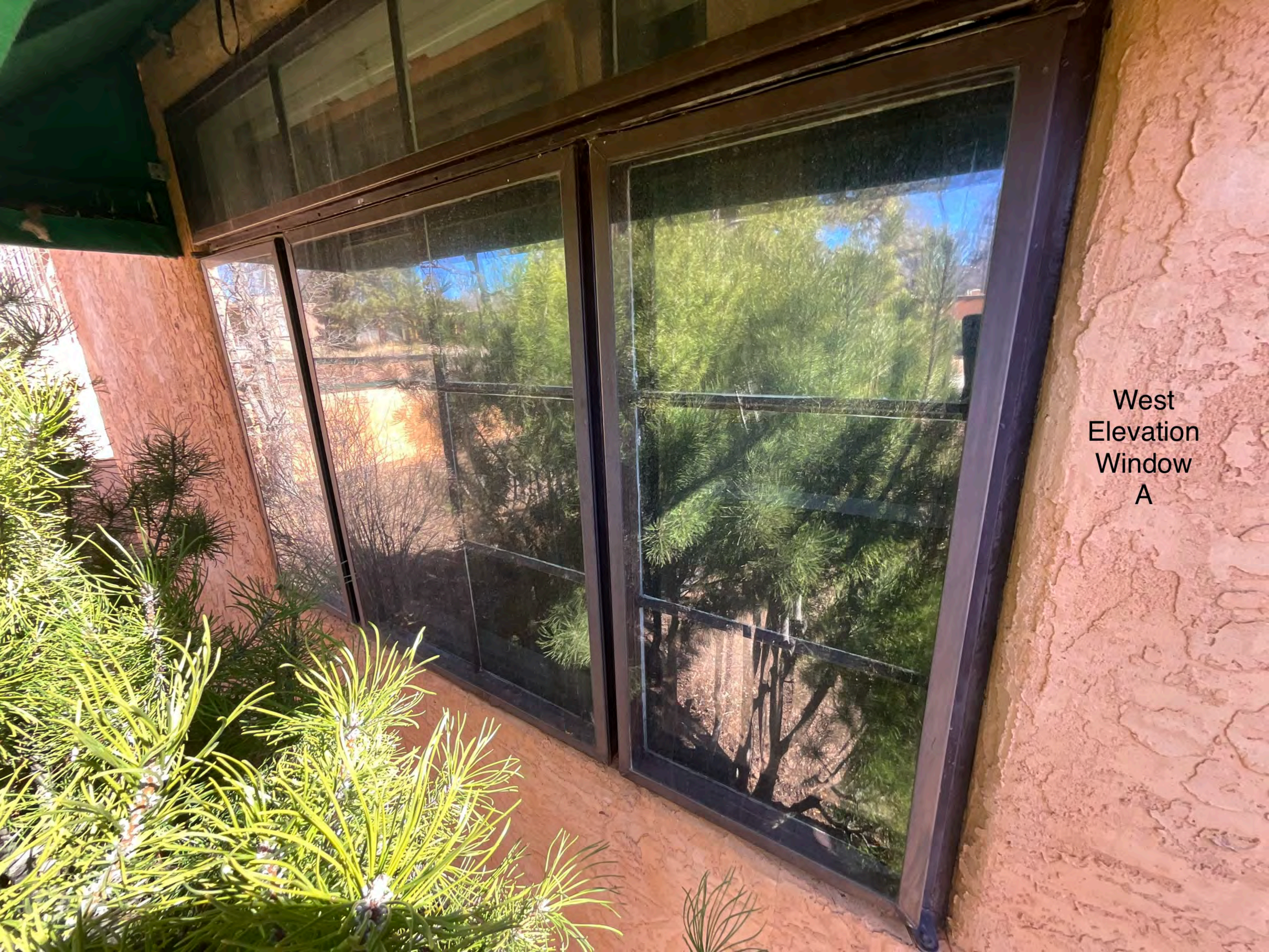
West Elevation Window A