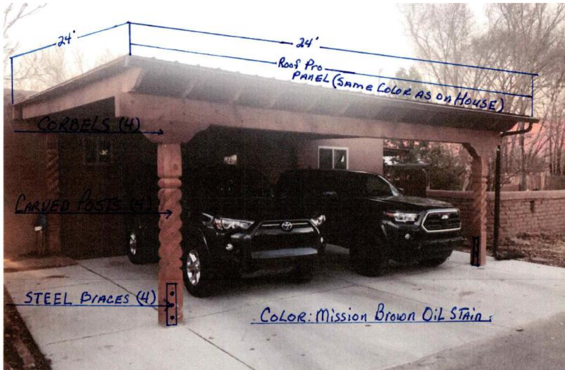
Figure 4: Carport Design