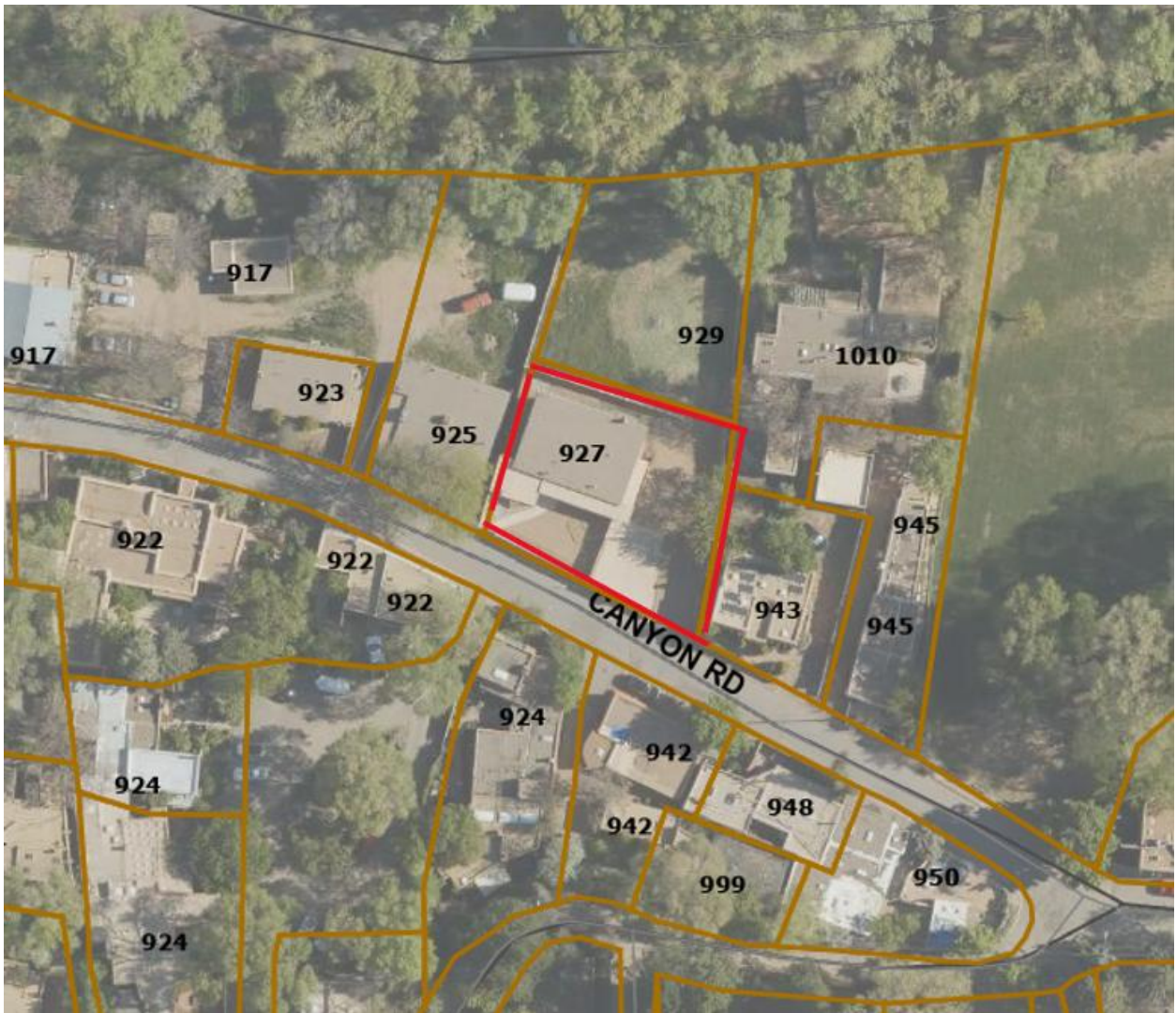
Figure 1: Property Location

The property lies within the Historic Downtown Archaeological Review District. See Chapter 14, SFCC, Article 14-3.13(B)(1). There may be archaeological concerns associated with this project, and archaeological clearance may be required.