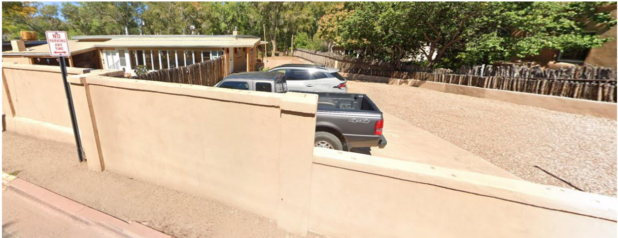
Figure 2: Street View of Residence

The lots in the subject streetscape vary in size. The buildings are set back from the street by three to ten feet, with most of them within five feet of the street. The commercial structures are located at the western end of the streetscape, with the residential at the eastern and central. The south side of the road is mostly Spanish Pueblo Revival style buildings with a few Territorial style buildings. The north side is characterized by primarily vernacular buildings with a few pitched roofs and a few Spanish Pueblo Revival style.