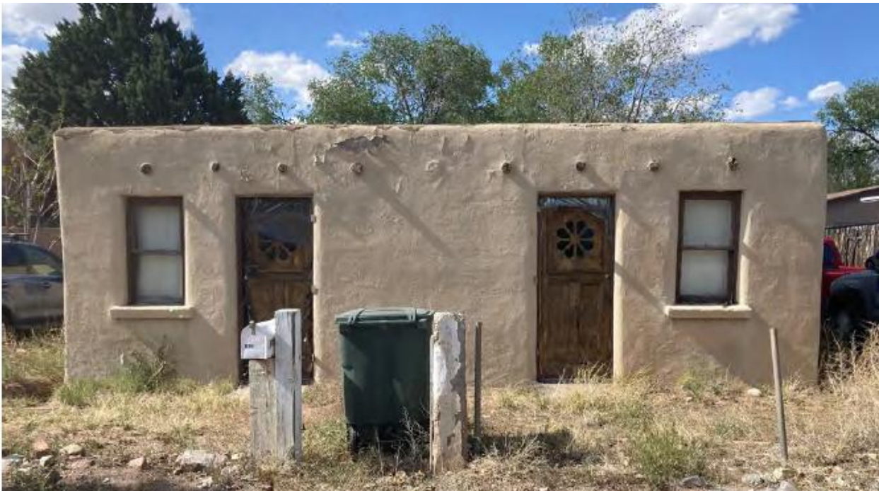
Figure 3: South Façade of Residence.

There is also a pentile-lined well on the west side of the property. The well is listed as a contributing structure.