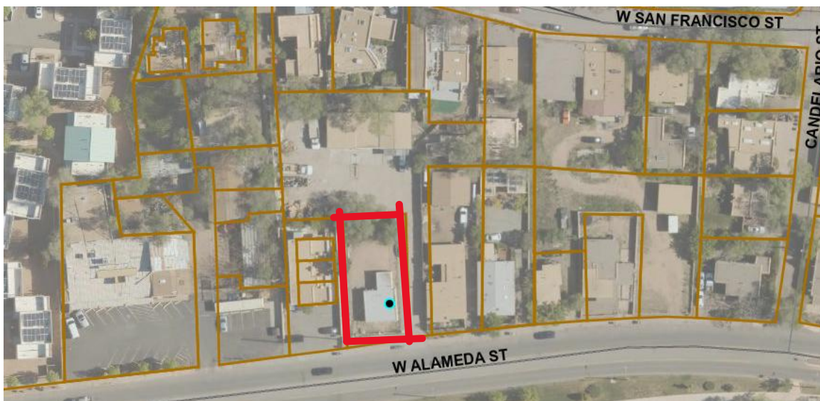
Figure 1: Location of Property.

Across from the Santa Fe River is the residential sector of Alameda Street. The houses range in style, with the most prominent styles being Spanish Pueblo Revival and Vernacular in this area. Most of the residences are lower single-story buildings with an average height on the streetscape of 12’8”. The street is lined with low yard walls with an average height of 46” (3’10”). The yard walls are stuccoed concrete masonry units that are colored to match the corresponding building.