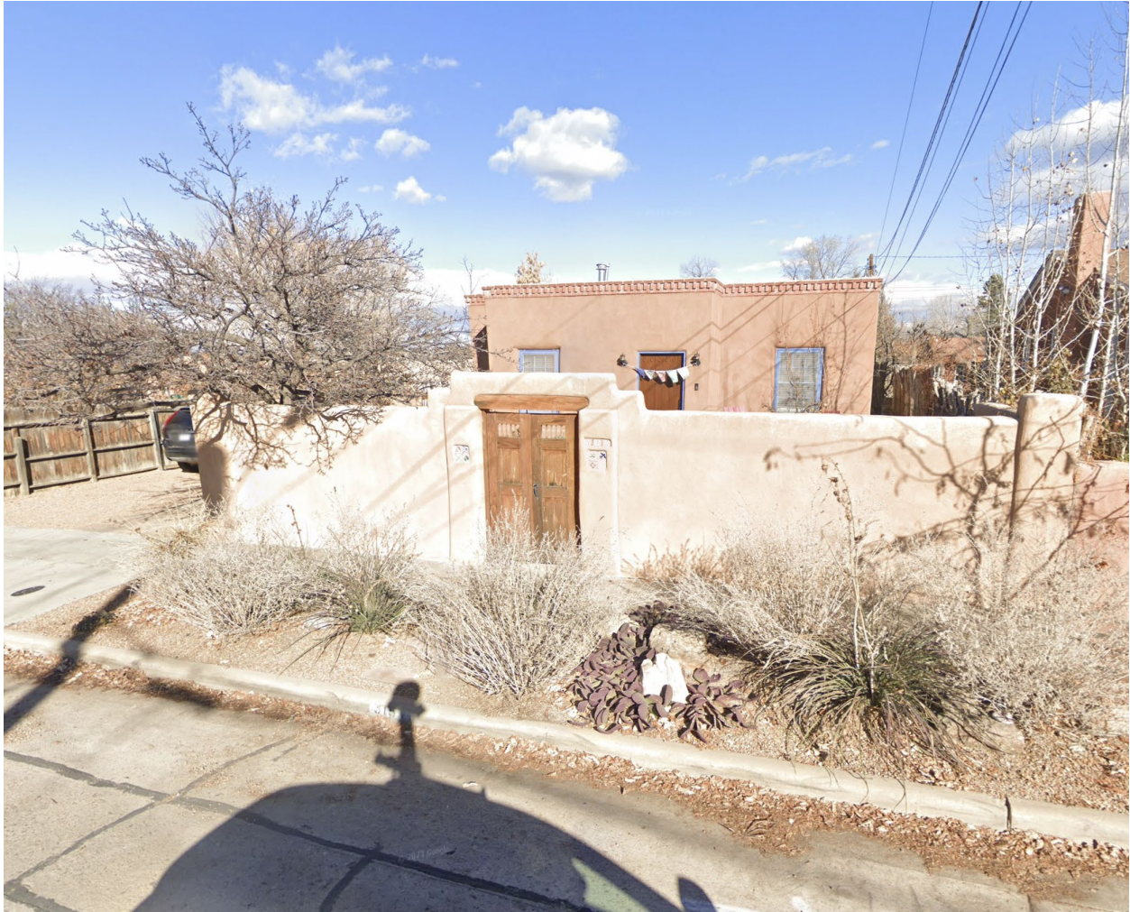
Photo looking north towards the property from Sena St.