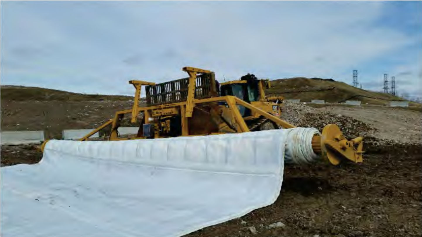
Photo 1: Tarp Being Deployed from Spool Assembly by a Tarpomatic Automatic Tarping Machine.