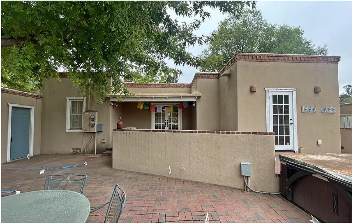
Photo 8: North (rear) elevation, center and west sections. Camera facing southwest.