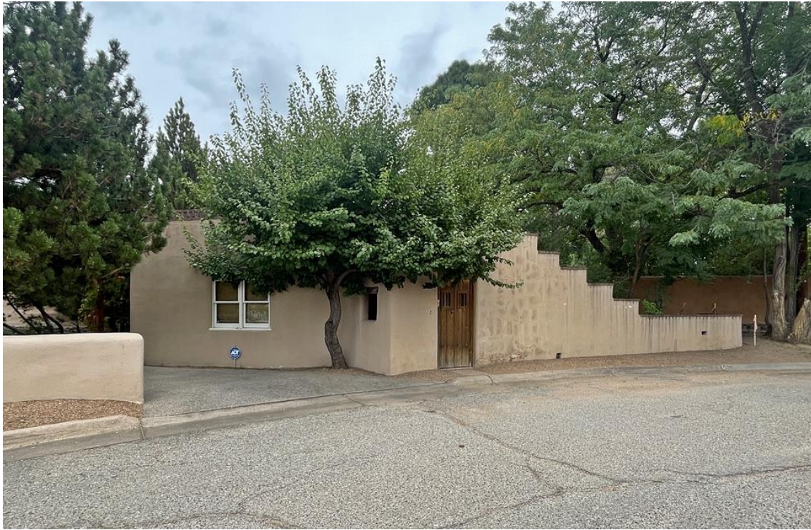
Photo 3: 521 A Calle Corvo. Newer building not included in survey. Camera facing southeast.