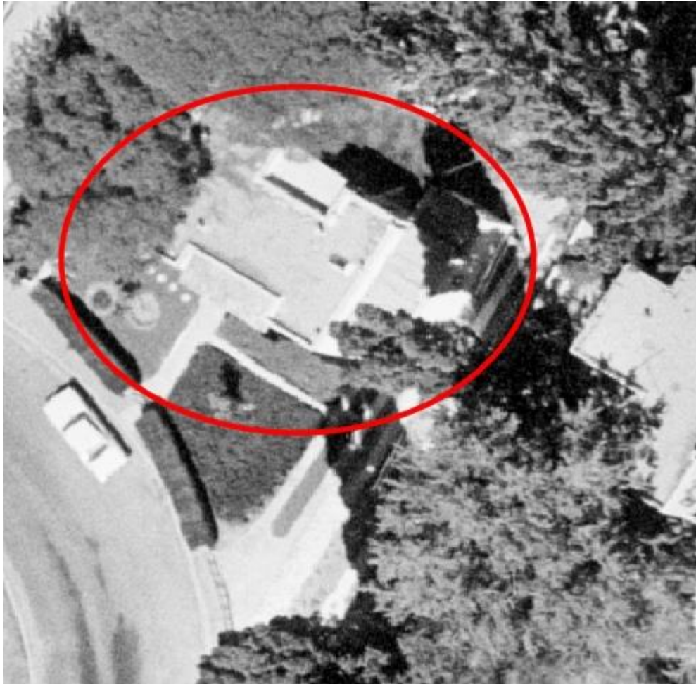
Figure 4: September 11, 1978, aerial photograph.