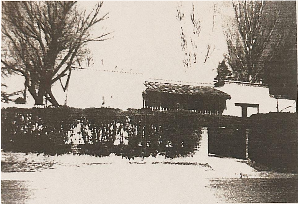
Figure 5: December 12, 1984, HBI survey photograph. Michael Belshaw. Note front yard wall.