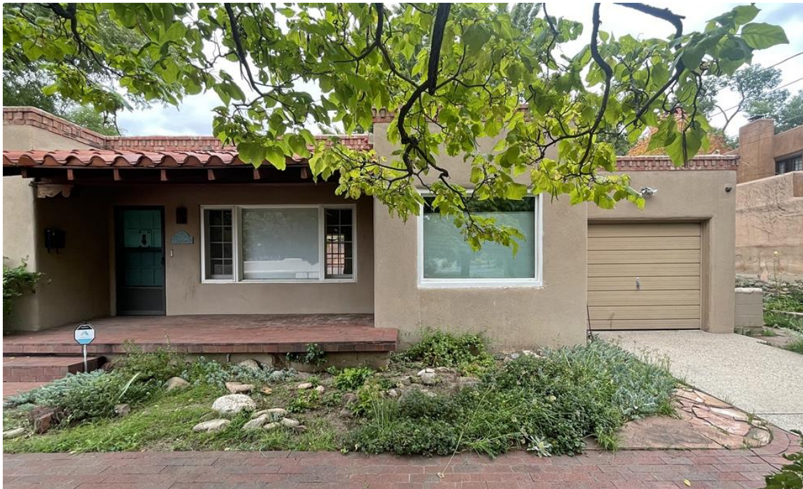
Photo 5: South (front) façade, center and east sections. Camera facing northeast.