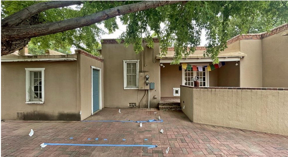
Photo 7: North (rear) elevation, east and center sections. Camera facing southwest.