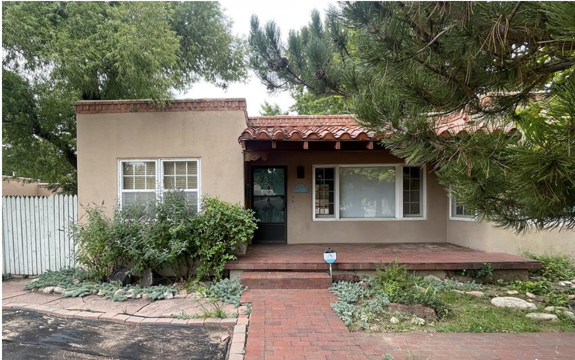
Photo 4: South (front) façade, west and center sections. Camera facing northeast.