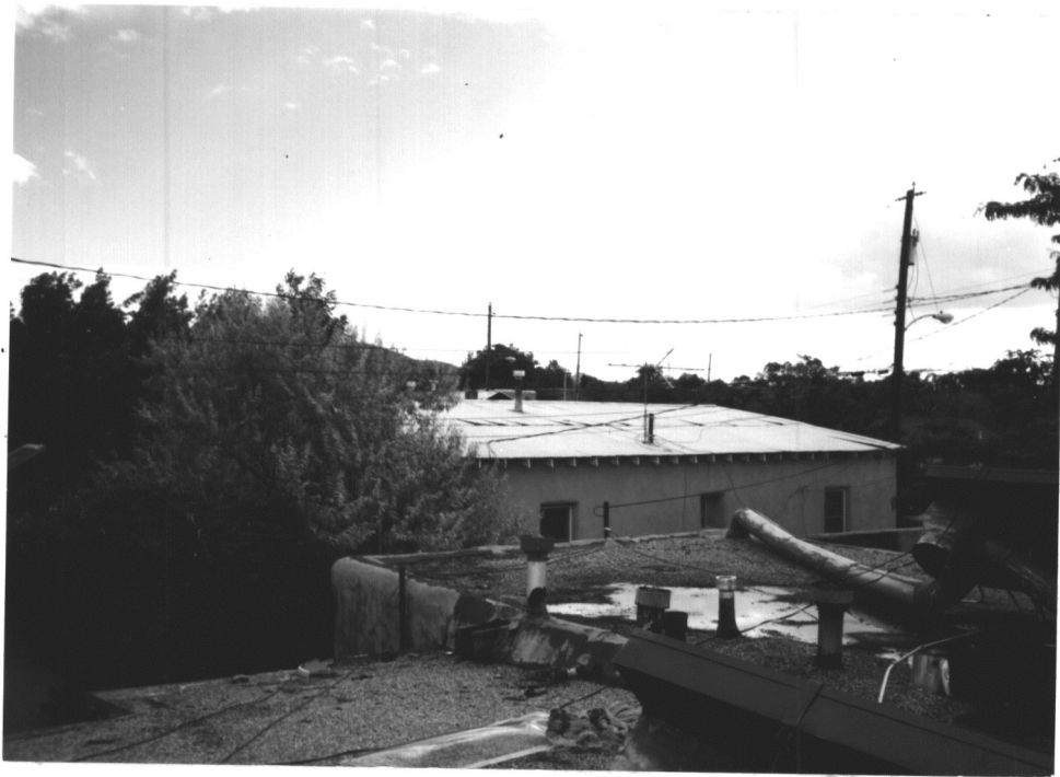
VIEW TO SOUTH EAST