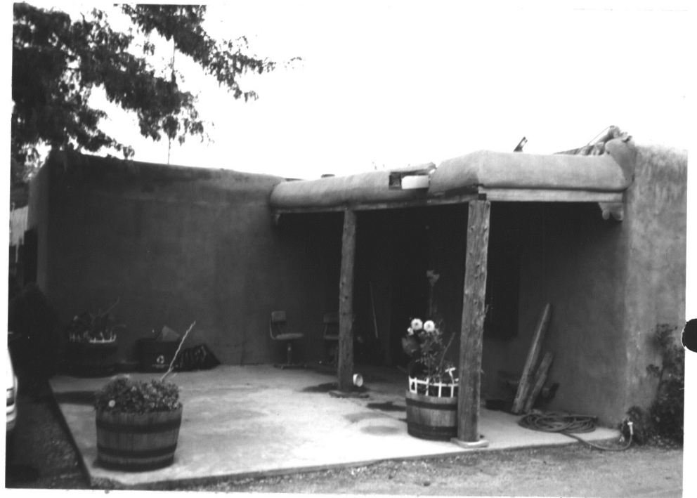
VIEW FROM SOUTH EAST