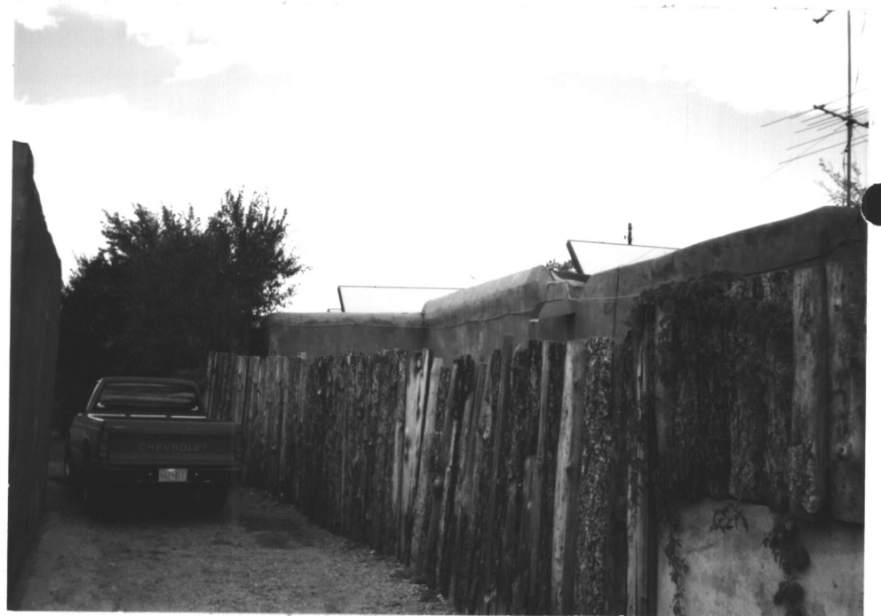
VIEW FROM SOUTH WEST