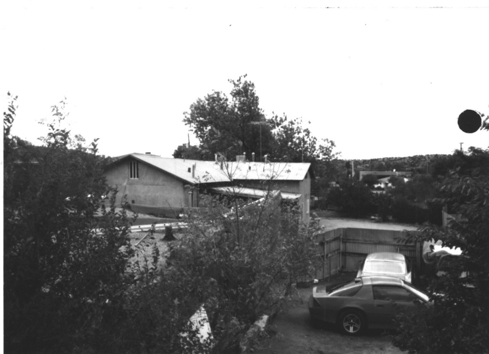
VIEW TO WEST