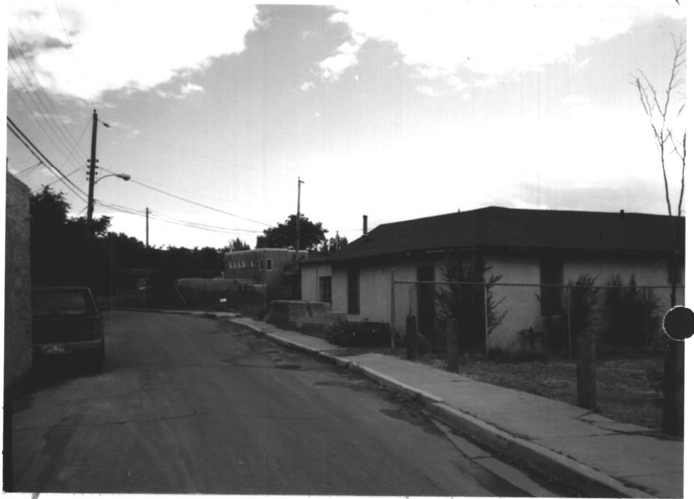
SAN FRANCISCO TO EAST