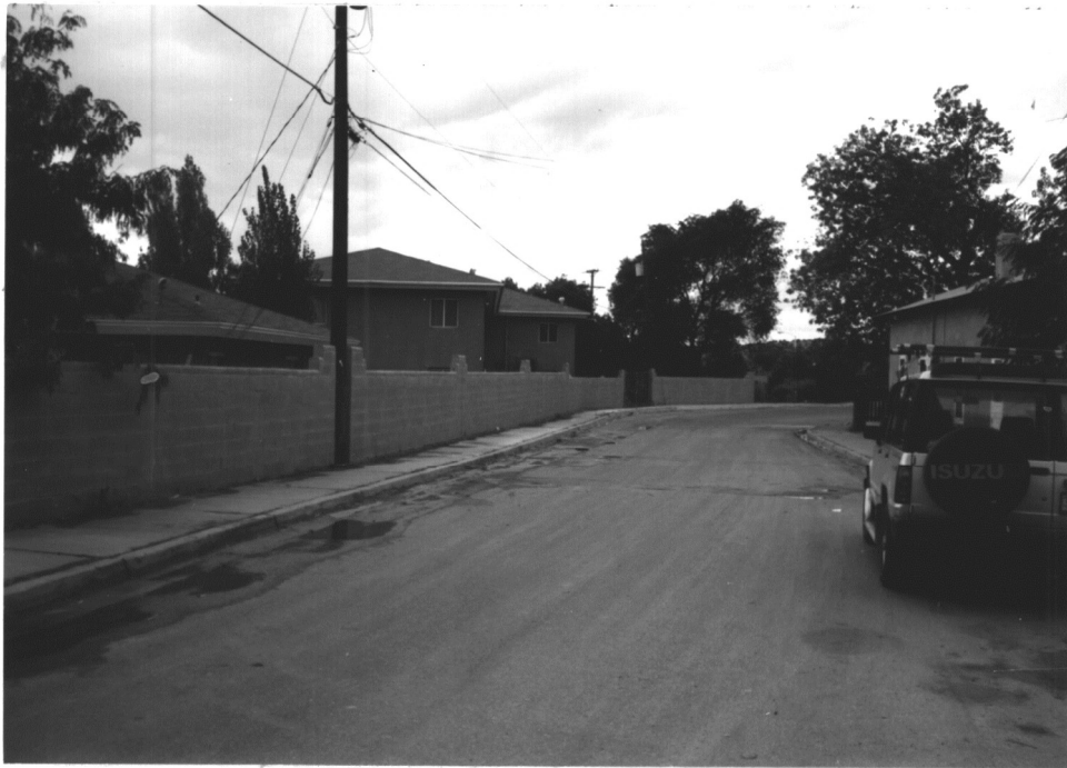
SAN FRANCISCO TO WEST