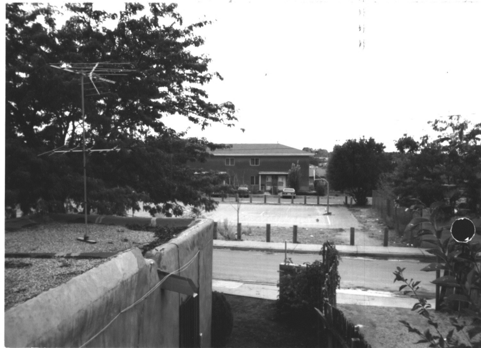
VIEW TO SOUTH