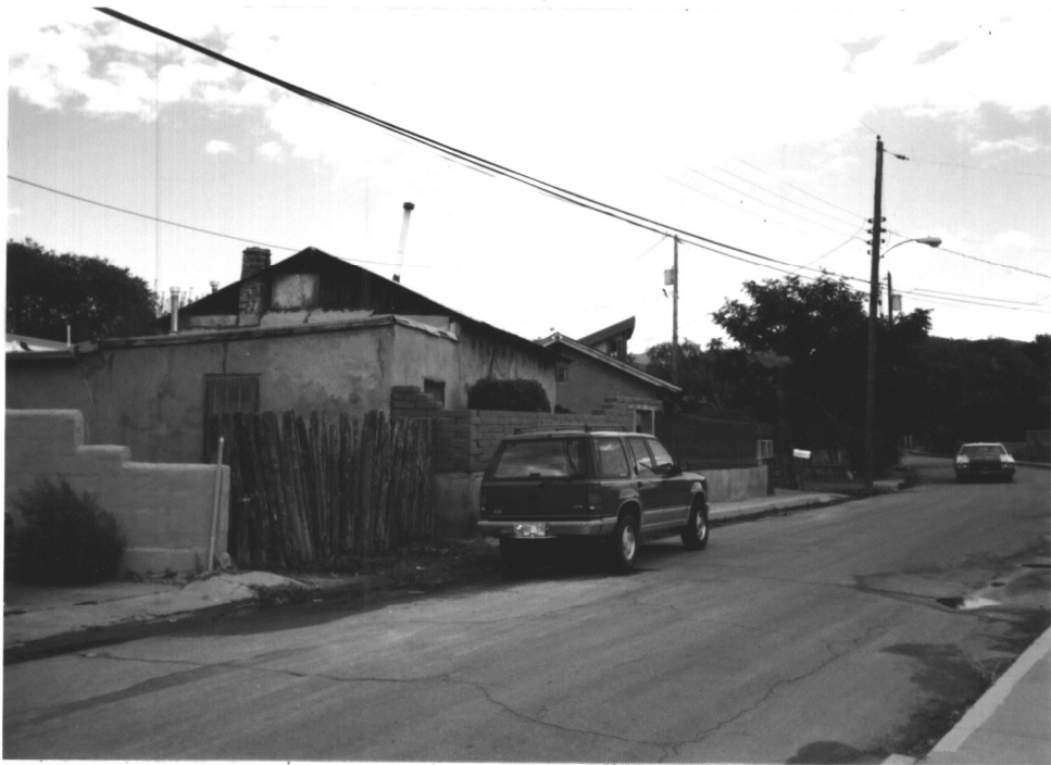
SAN FRANCISCO TO EAST