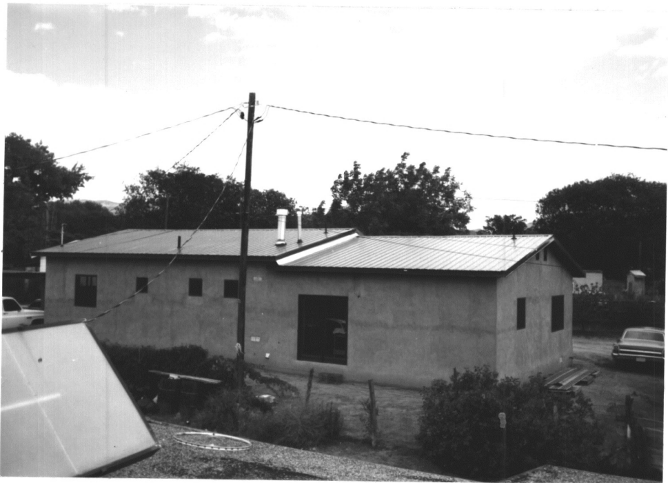
VIEW TO EAST