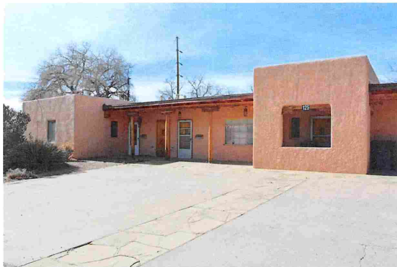
Photo 3: North Unit (top), facing northwest; South Unit (bottom), facing southwest.