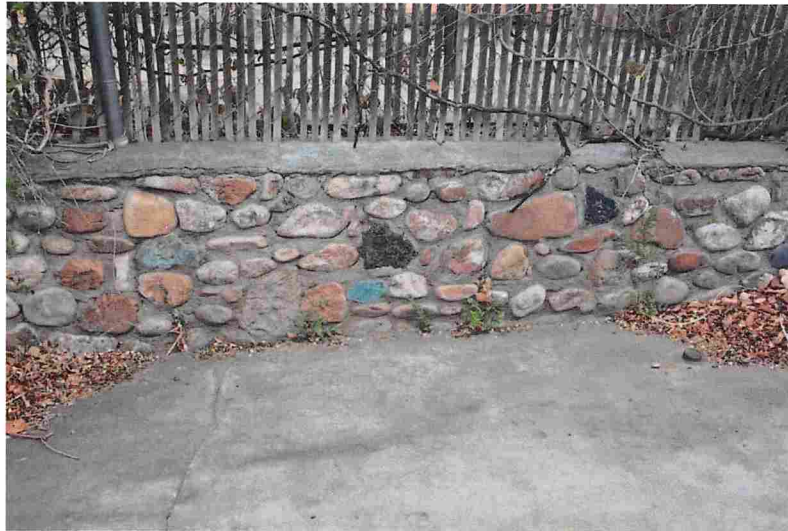
Photo 5: Retaining separating 121 and 125 Camino Santiago, facing northeast. May 3, 2018.