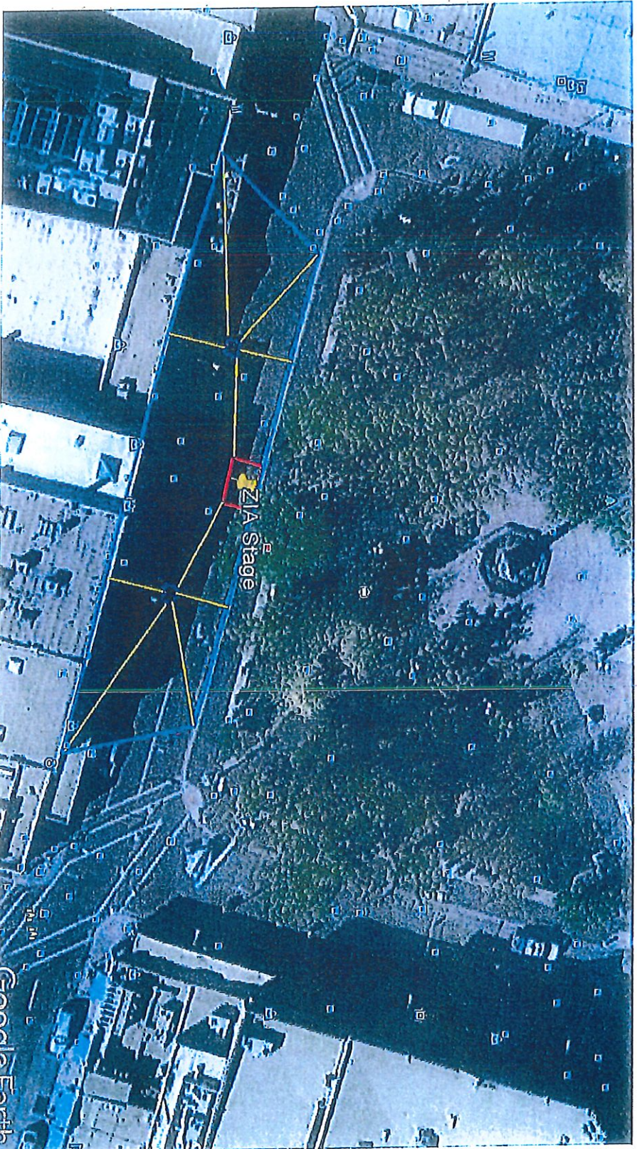
Second Firing Location from the plaza area on San Francisco Street.

Requirements they are to provide for the close-proximity theatrical pyro on San Francisco Street