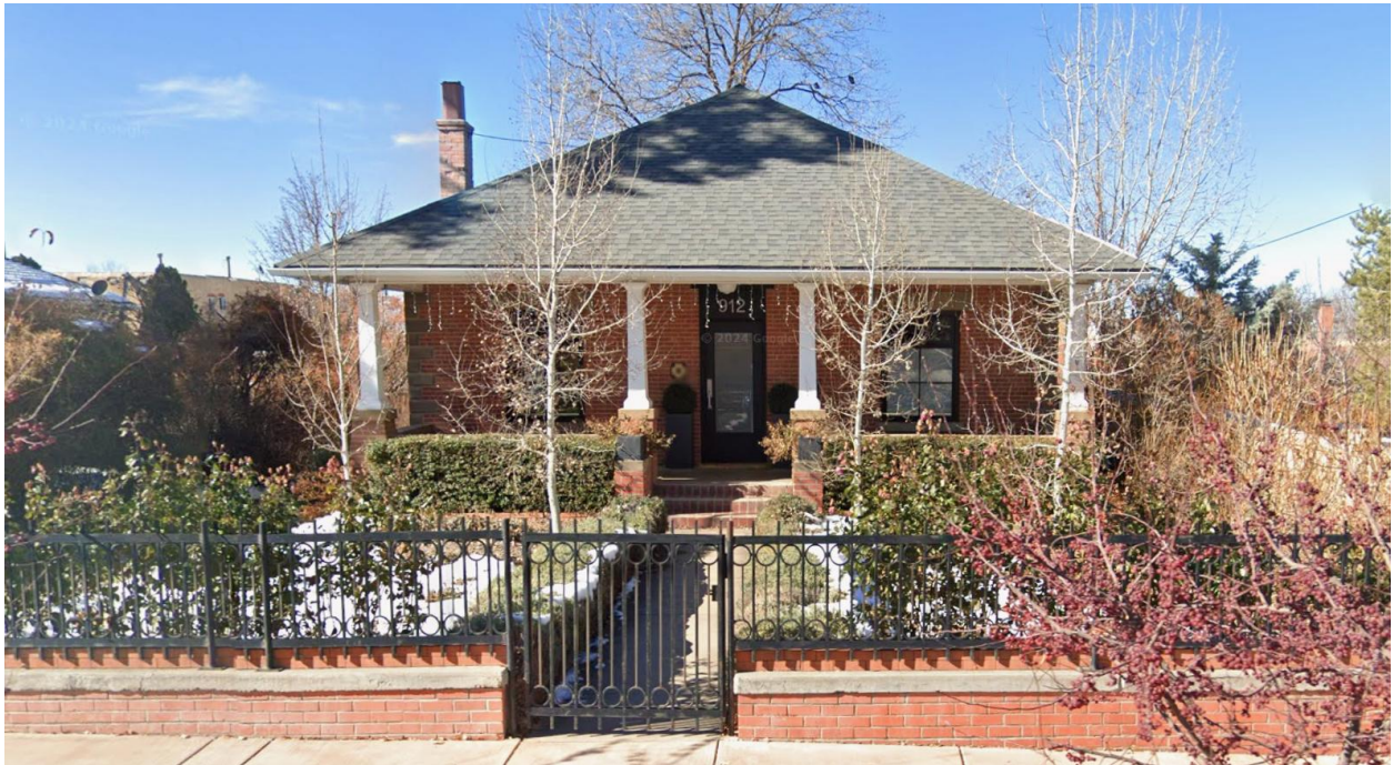
Figure 2: Street View of Structure

The streetscape is defined as running from the edge of the historic district at Coronado, going north past Berger Street to the northern edge of the 717 Don Gaspar property. The area has sidewalks on each side of the street with vegetation between the sidewalk and the street. There is street parking on the east side of the one-way street. Most of the front yards are open with low retaining or yard walls. There is a mix of stone walls, picket fences, metal and wrought iron, and chain link fencing. There is a combination of Spanish Pueblo Revival, Territorial Revival, and Victorian style residences set back from the street with vegetation in the yards between the street and the residences. Many roofs are pitched in either red or brown, and there is a combination of wall colors from a yellow tan to medium brown stuccos. There are also red brick houses, and the trims tend to be in brown, green, or white. The Victorian buildings tend to be stuccoed or painted to match the other style homes.