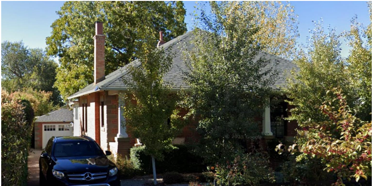
Figure 3: Street view of the residence with the garage behind