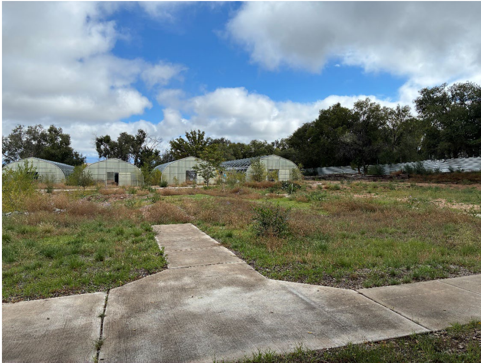
Photo standing on the property looking east at the existing greenhouses where the main facility is proposed.