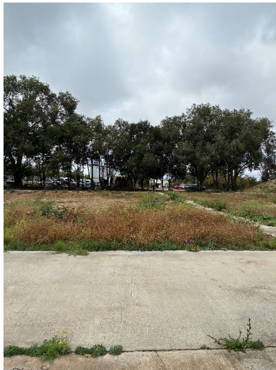
Photo in same spot as previous, but facing west toward the current and proposed parking area.