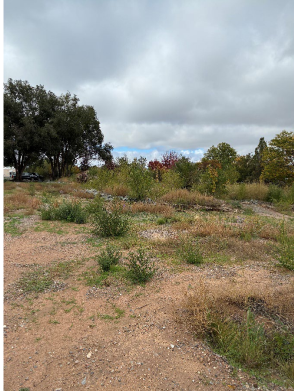
Looking north into forested parts of lot.