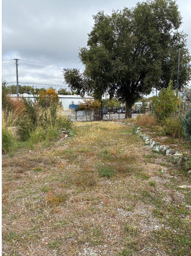
Current site access off Rufina St that is planned to be used for the caretakers residence.