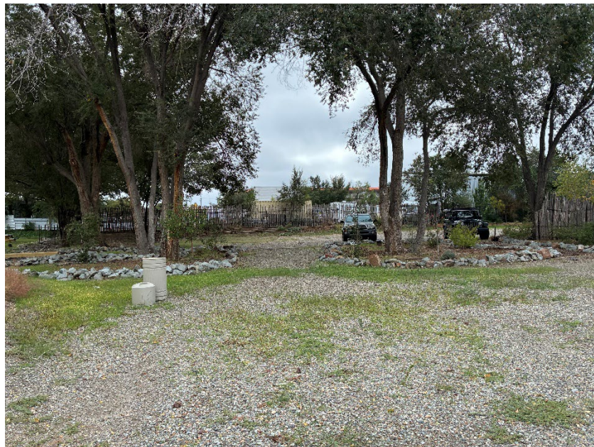
Area planned to be used for parking.