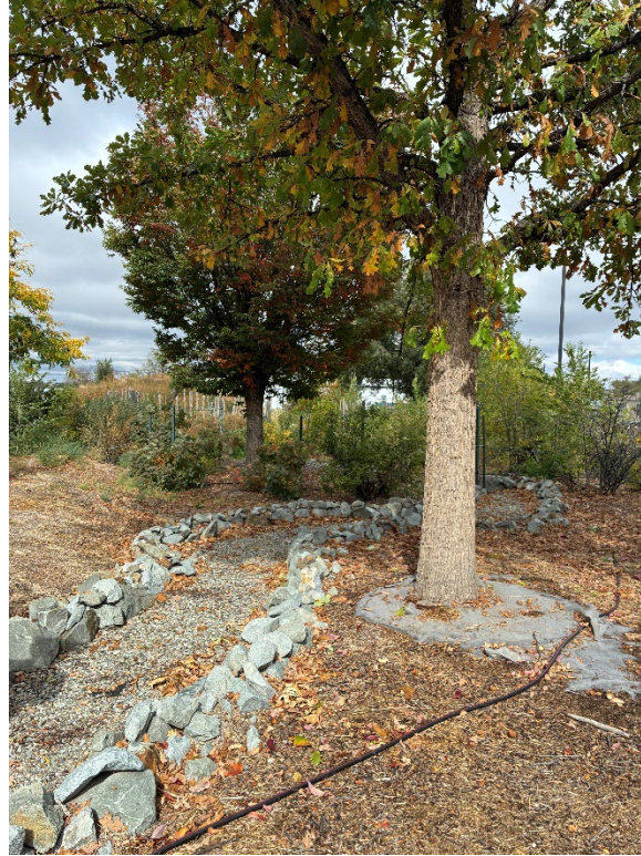
Existing walkways on site.