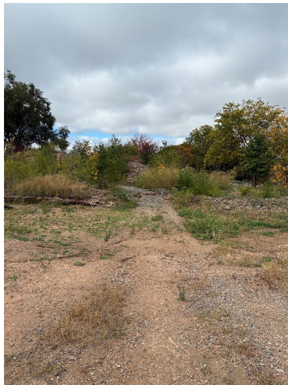
Looking towards north side of property at manmade 30% or greater slopes.