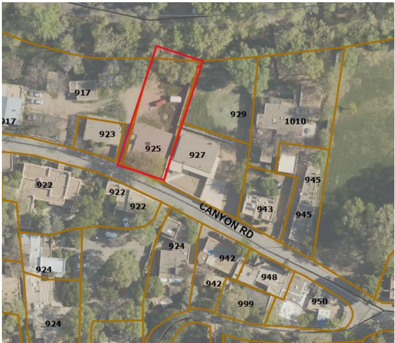
Figure 1: Property Location

The property lies within the Historic Downtown Archaeological Review District. See Chapter 14, SFCC, Article 14-3.13(B)(1). There may be archaeological concerns associated with this project, and archaeological clearance may be required.