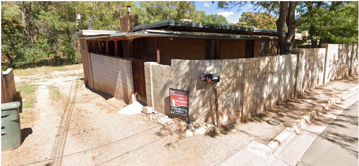
Figure 2: Street View of Residence

The lots in the streetscape vary in size. The buildings are set back from the street by three to ten feet, with most of them within five feet of the street. There are commercial structures located at the western end of the streetscape, with the residential at the eastern and central. The south side of the road is mostly Spanish Pueblo Revival style buildings with a few Territorial style buildings. The north side is characterized by primarily vernacular buildings with a few pitched roofs and a few Spanish Pueblo Revival style.