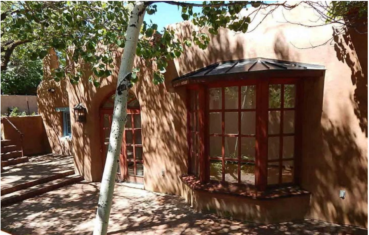
Figure 3. East Facade III.