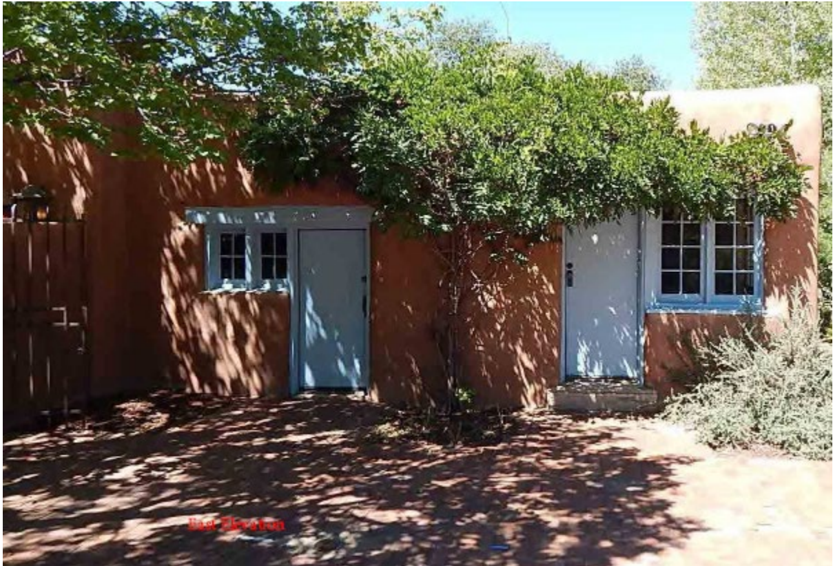
Figure 1. East Facade I.

The single-family residence at 439 Camino del Monte Sol Lot 1-A is listed as significant to the Downtown and Eastside Historic District. The main residential structure was built in 1925 on a 0.73-acre parcel and comprises of 5,894 sq. ft. of roofed area. The 1991 New Mexico Historic Building Inventory (HBI) survey form records the architectural design style as Spanish-Pueblo Revival as seen by the adobe block and wooden viga construction material, recessed doors and windows, and flat roof with rounded parapets. The structure has undergone several alterations and additions in the 1990s as noted below, however the core structure maintains the original inception of design and character to the streetscape and district in which it resides. The proposed detached garage addition will not impact the current status and integrity of the structure.