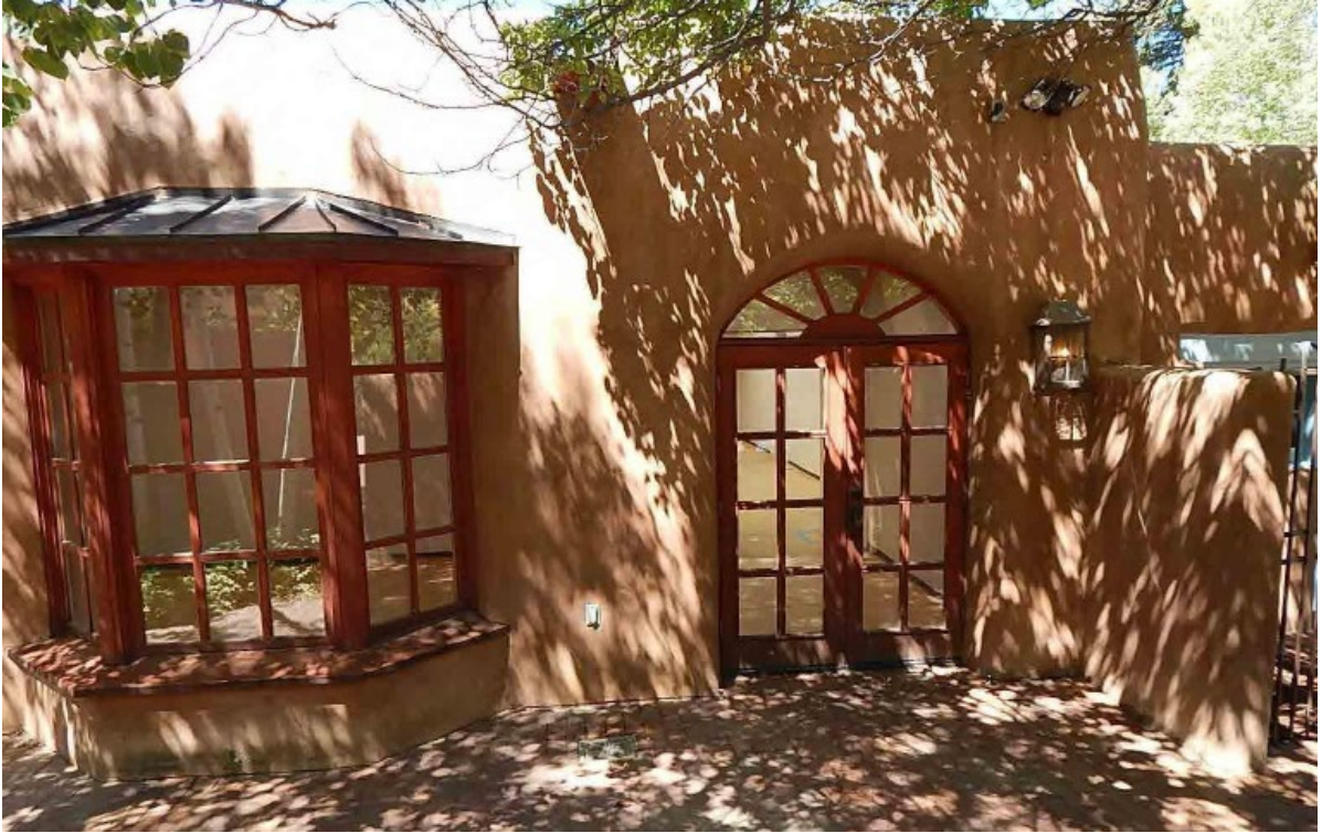
Figure 2. East Facade II.