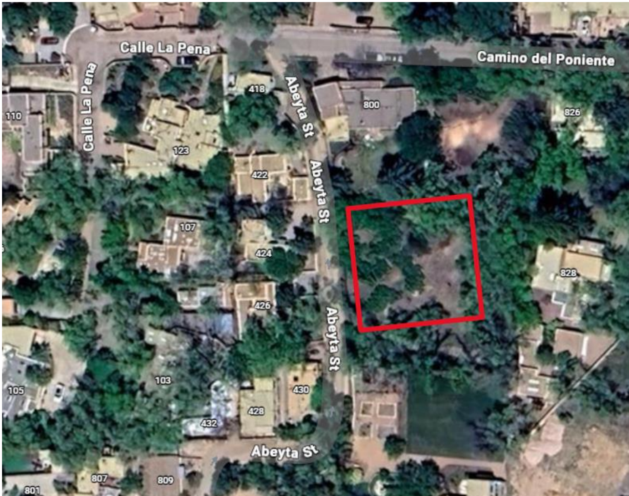
Figure 1: Location of property