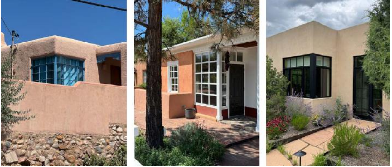
Figure 3: Applicant provided examples

In the spirit of reiterating this certain component of the district’s character, the client and the architect would like to deploy a corner window unit in the publicly visible kitchen area (see elevations).