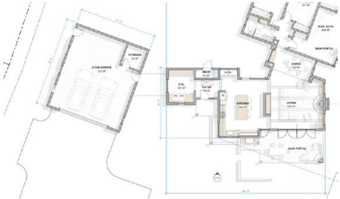
Figure 4: Applicant provided site plan