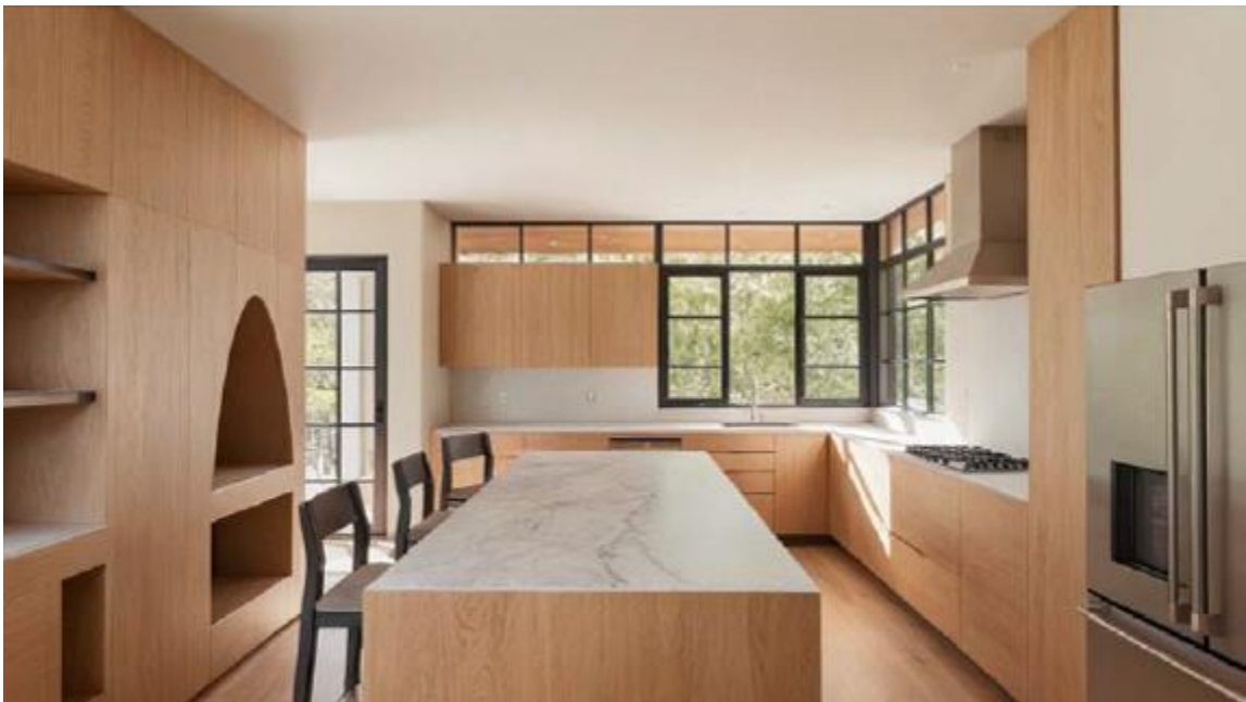
Figure 5: Applicant provided interior rendering

Staff Response: The staff finds that this criterion is not met. Having a particular view of the lot is not a hardship but a desire. While it is helpful to see the drive to be alerted when visitors