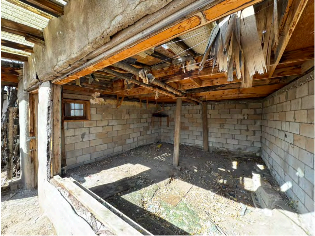
INTERIOR FROM THE SOUTH