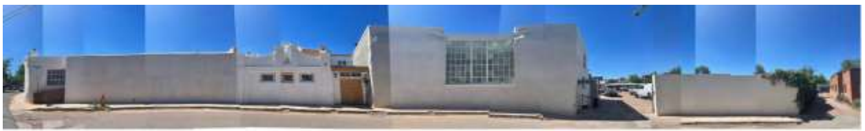
206 McKenzie Street McKenzie Street / North Elevation