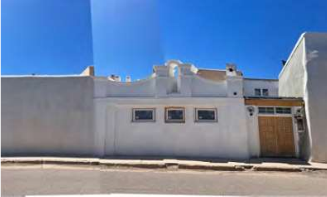
Figure 4. North Primary Facade.