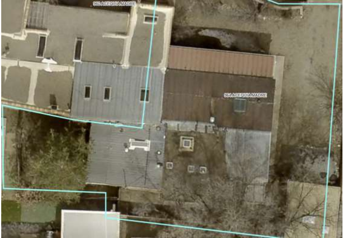
Figure 2. Current roof condition.

Previous cases at 964 Acequia Madre include: