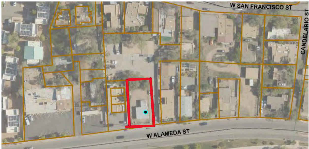
Figure 1: Location of Property.

Across from the Santa Fe River is the residential sector of Alameda Street. The houses range in style, with the most prominent styles being Spanish Pueblo Revival and Vernacular in this area. Most of the residences are lower single-story buildings with an average height on the streetscape of 12’8”. The street is lined with low yard walls with an average height of 46” (3’10”). The yard walls are stuccoed concrete masonry units that are colored to match the corresponding building.