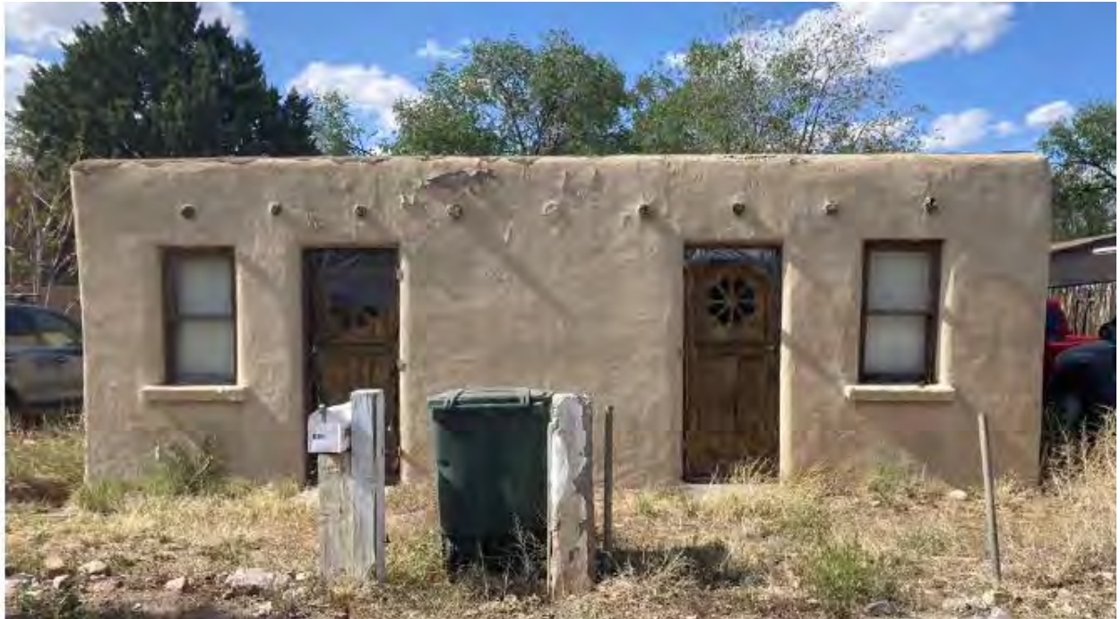
Figure 3: South Façade of Residence.

paint on the stucco. The property holds a front wire fence with a wire gate, a side chain link fence, short cast concrete posts, a couple of wood posts, and possible remains of a stone boundary. The residence is typical of the streetscape.