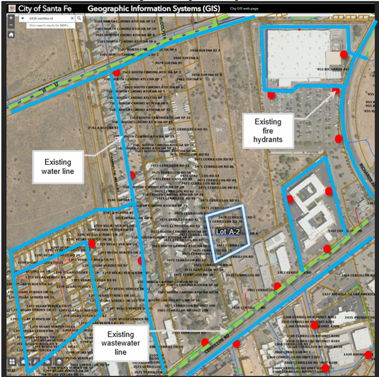
Figure 5: Existing Utilities Diagram