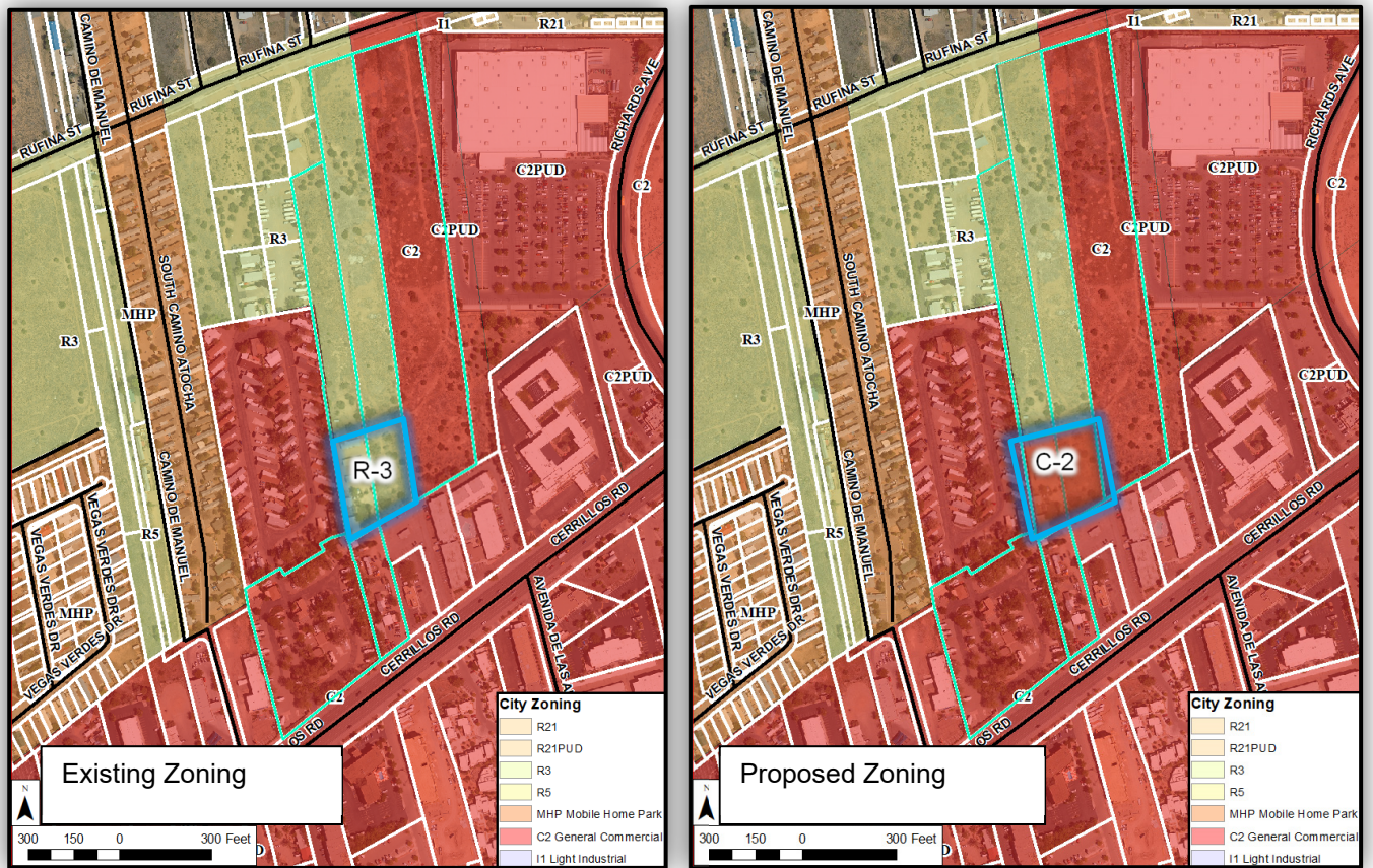
Figure 4: Existing and Proposed Zoning