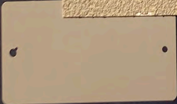
Sierra Pacific Tan 043