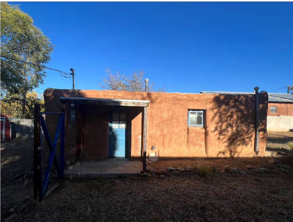
West Side - Residence Elevation