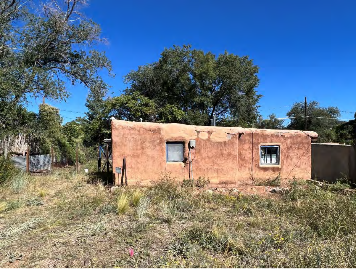
South Side – Residence Front Elevation