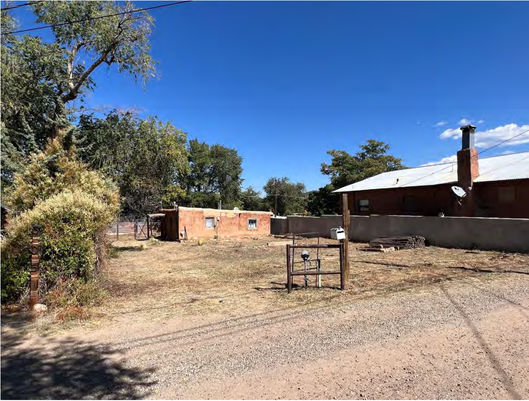
Don Miguel Place – Looking North East