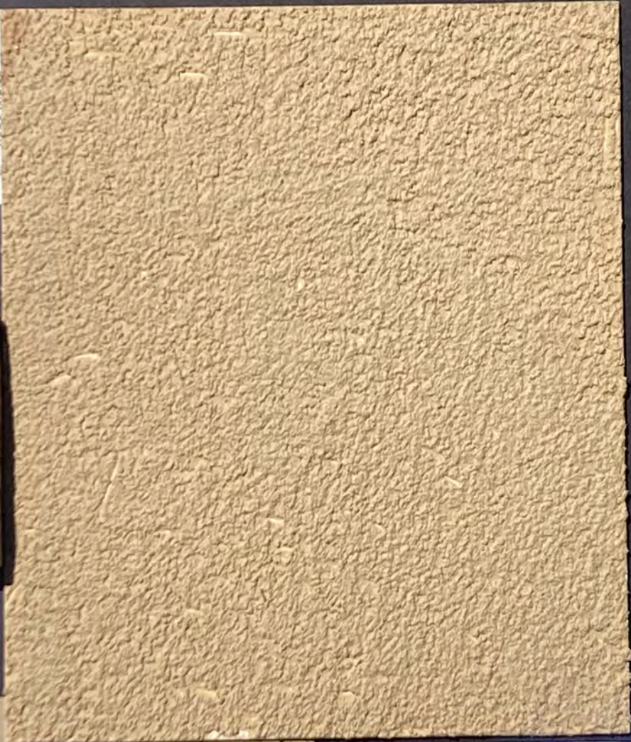
La Habra Sarah 135