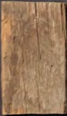
Cabot Dark Gray