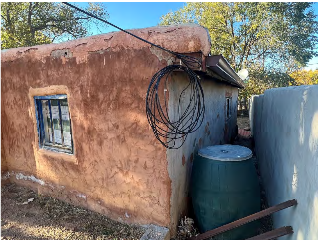
East Side - Residence Elevation