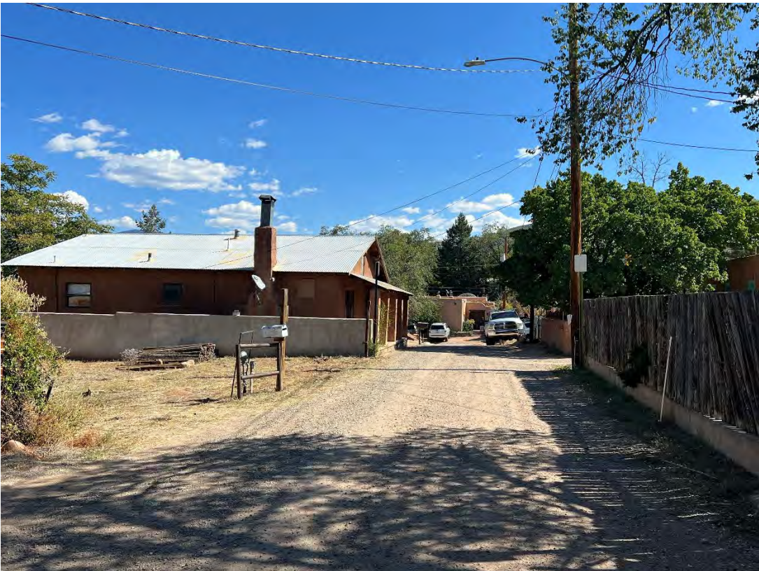
Don Miguel Place – Looking East