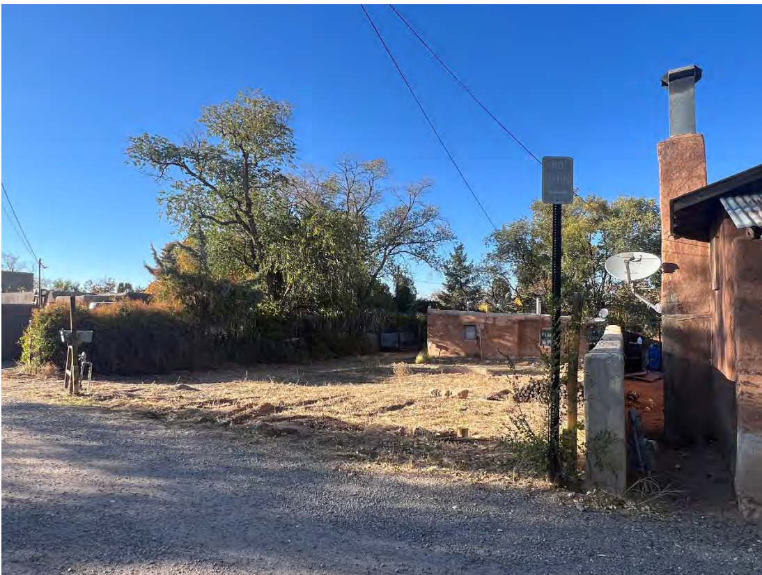
Don Miguel Place – Looking North West