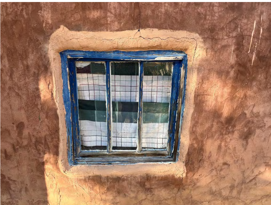
Existing Window - South Front Elevation