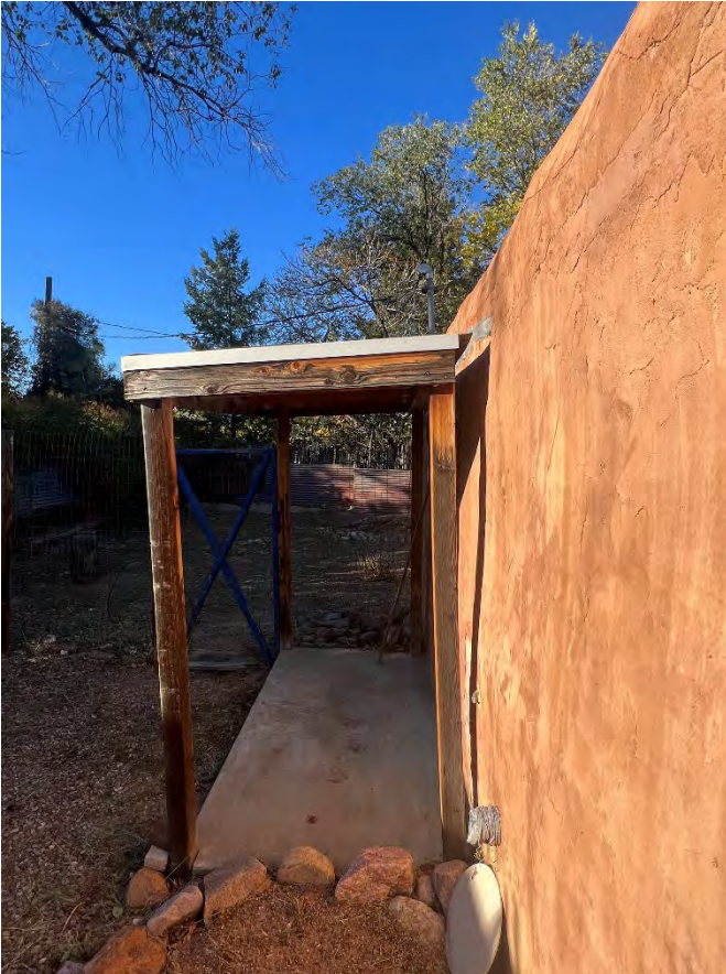
Existing Detached Portal – West Side Elevation