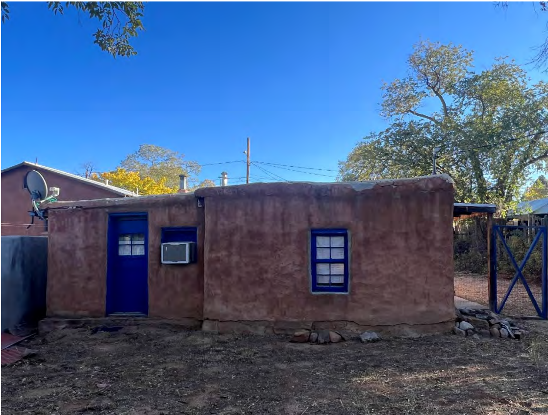
North Side – Residence Rear Elevation