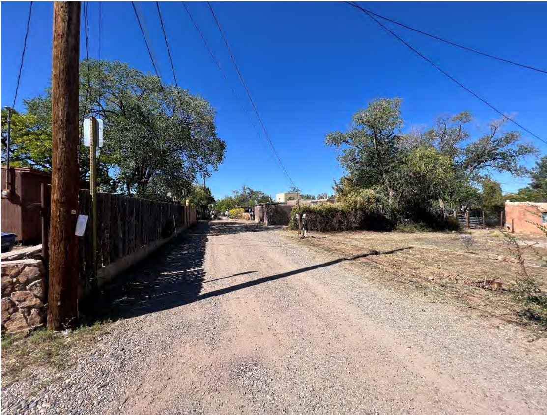
Don Miguel Place – Looking West