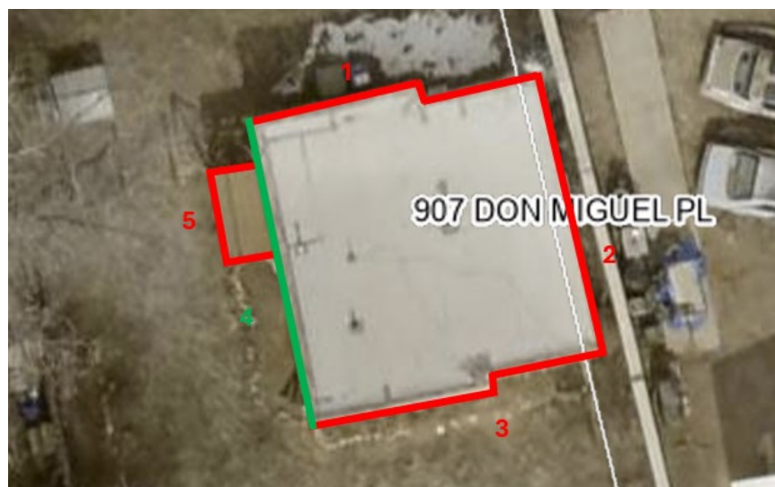
Figure 1 907 Don Miguel Place: Façade Diagram

On November 14, 2006, in Case No. H-06-102, the HDRB upgraded the historic status of the main residential building to contributing.