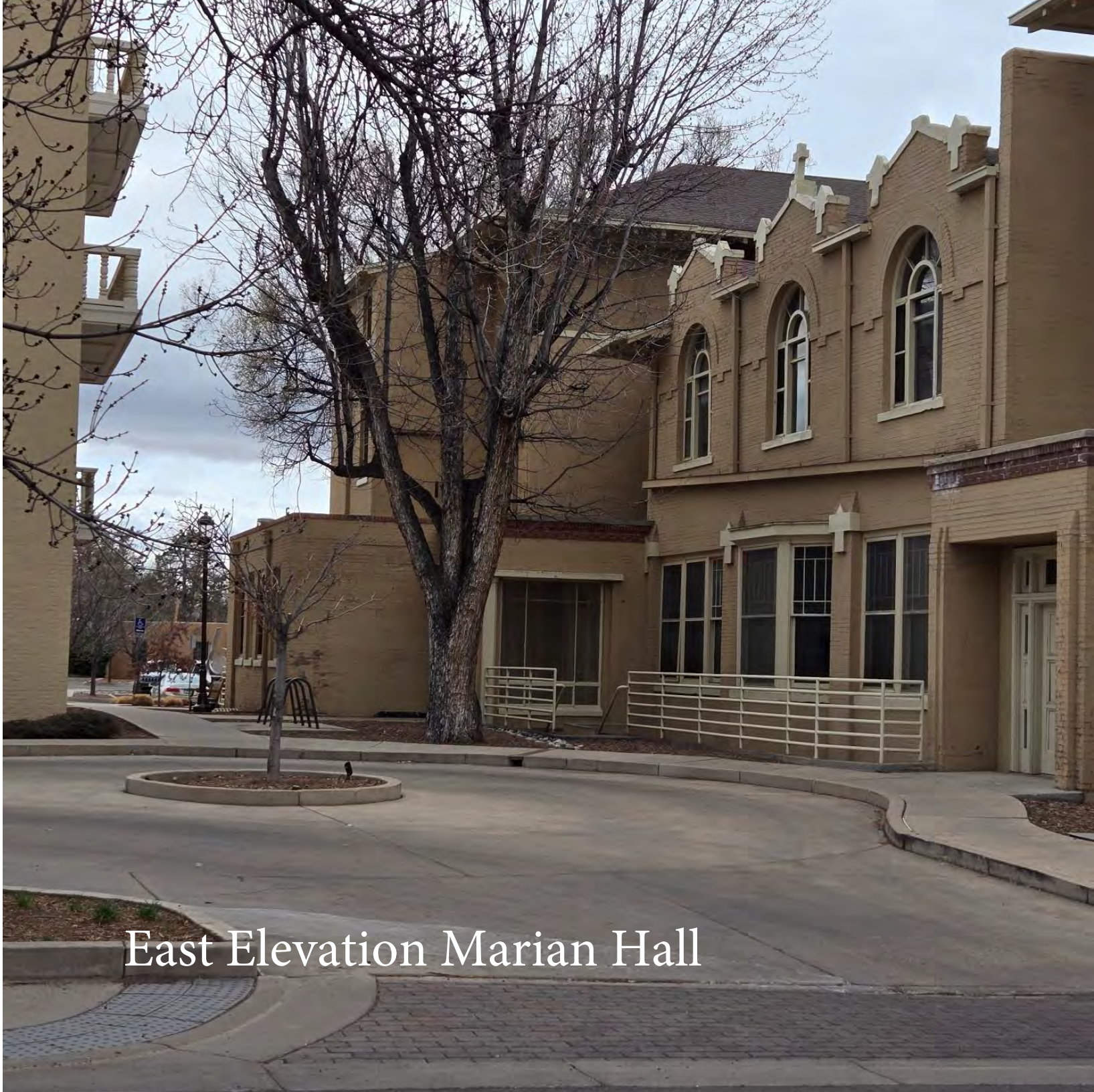
East Elevation Marian Hall