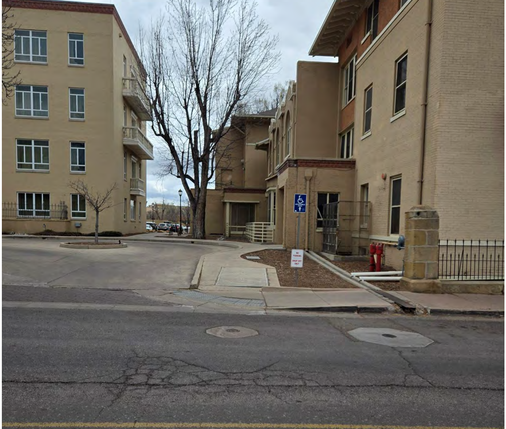
Area Between Marian Hall and Drury Hotel