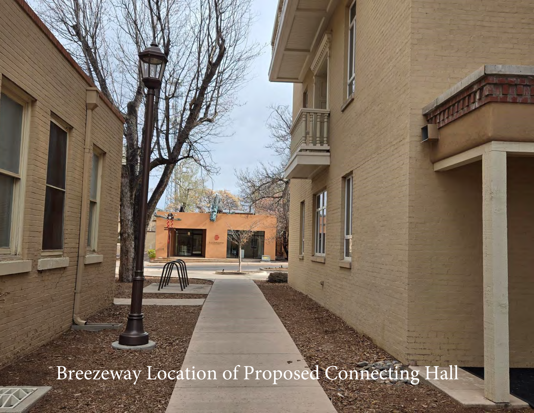
Breezeway Location of Proposed Connecting Hall