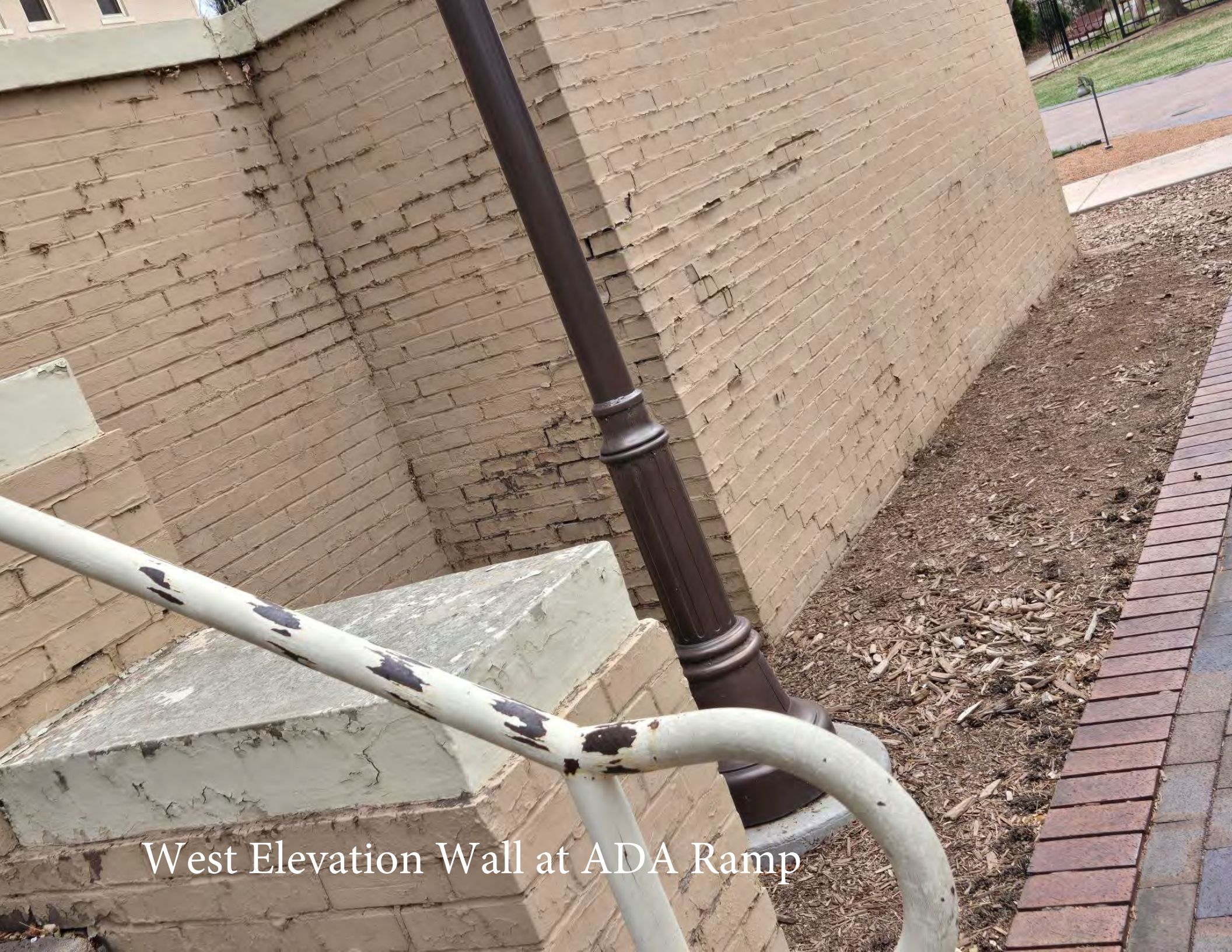
West Elevation Wall at ADA Ramp