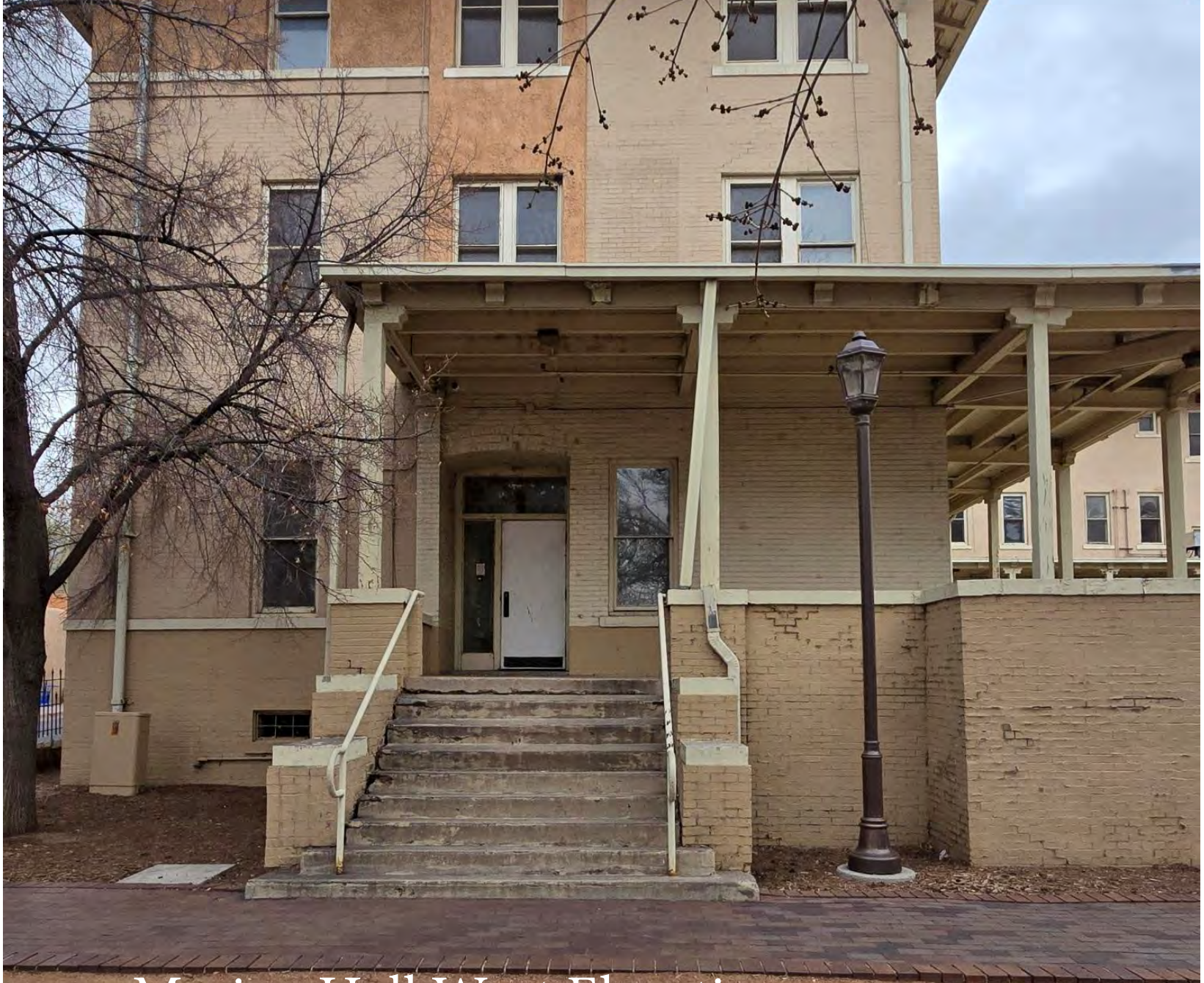
Marian Hall West Elevation