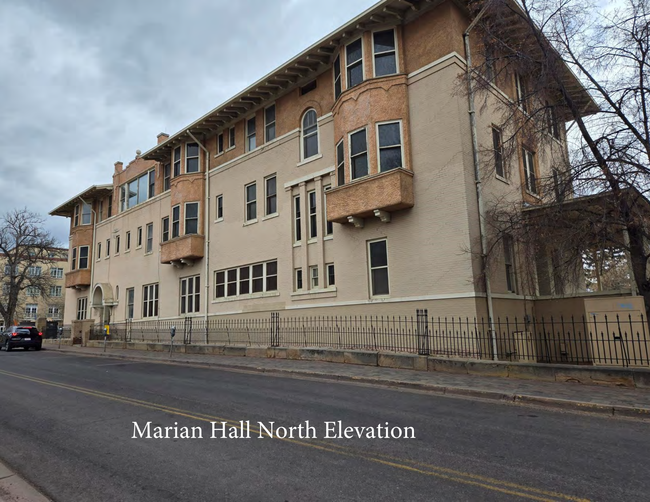
Marian Hall North Elevation