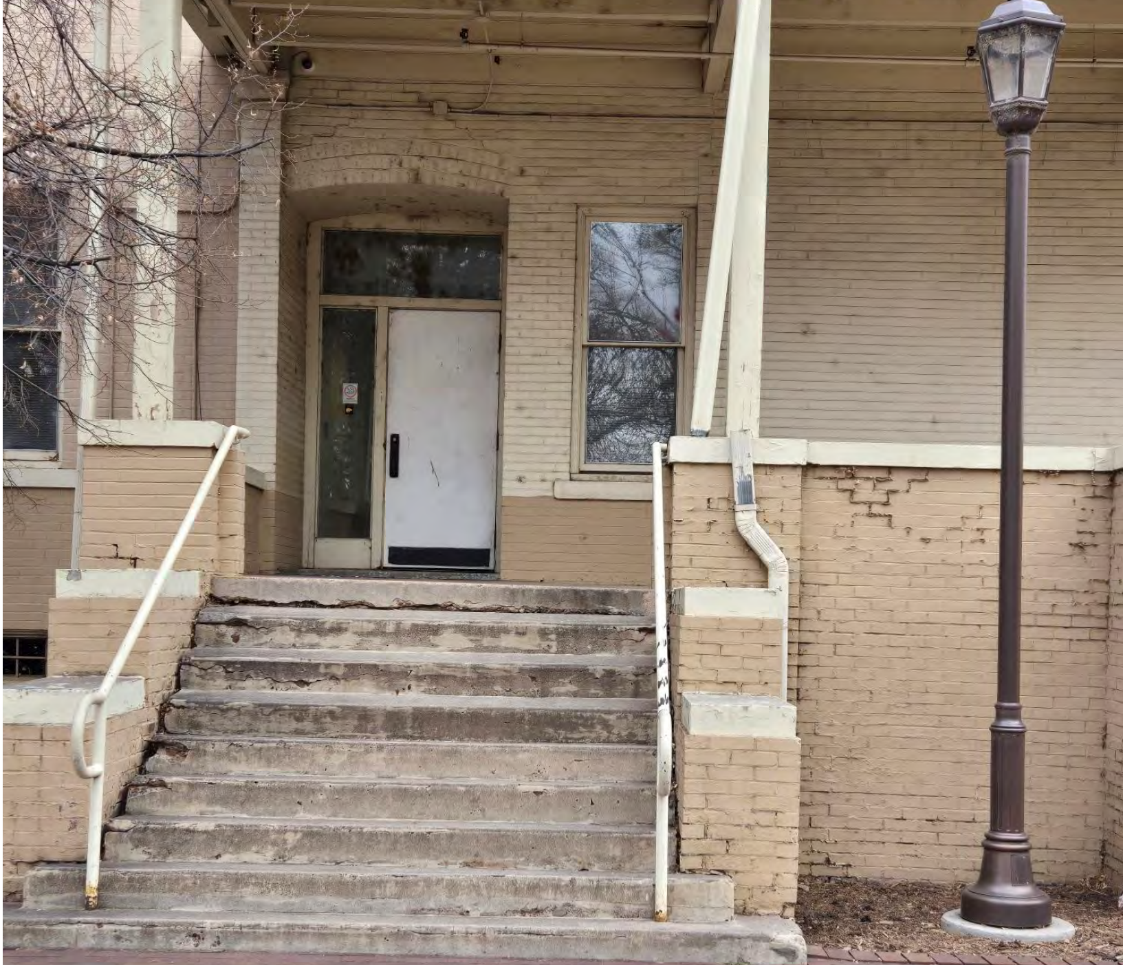
Marian Hall West Elevation Entry Door