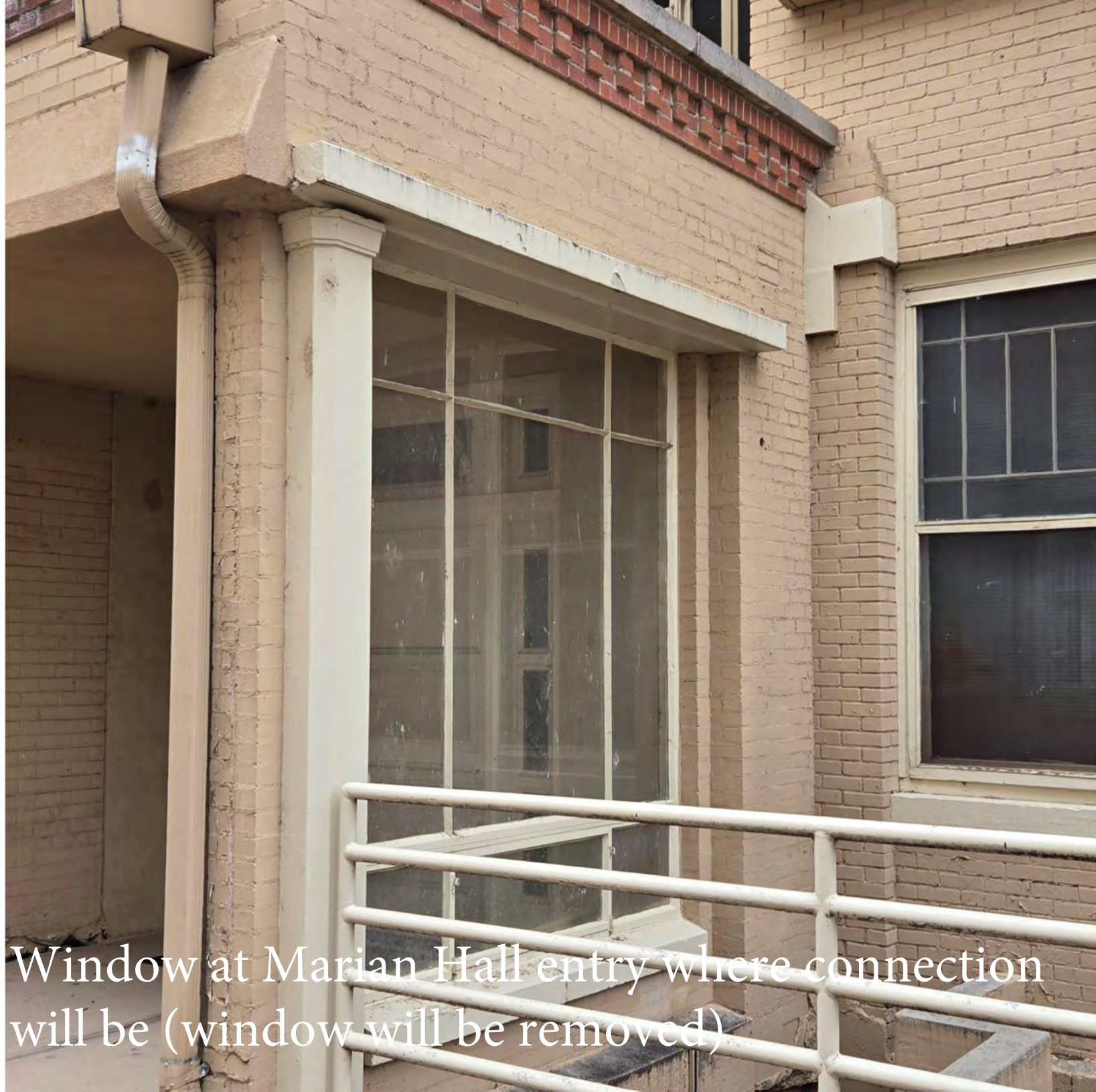
Window at Marian Hall entry where connection will be (window will be removed)