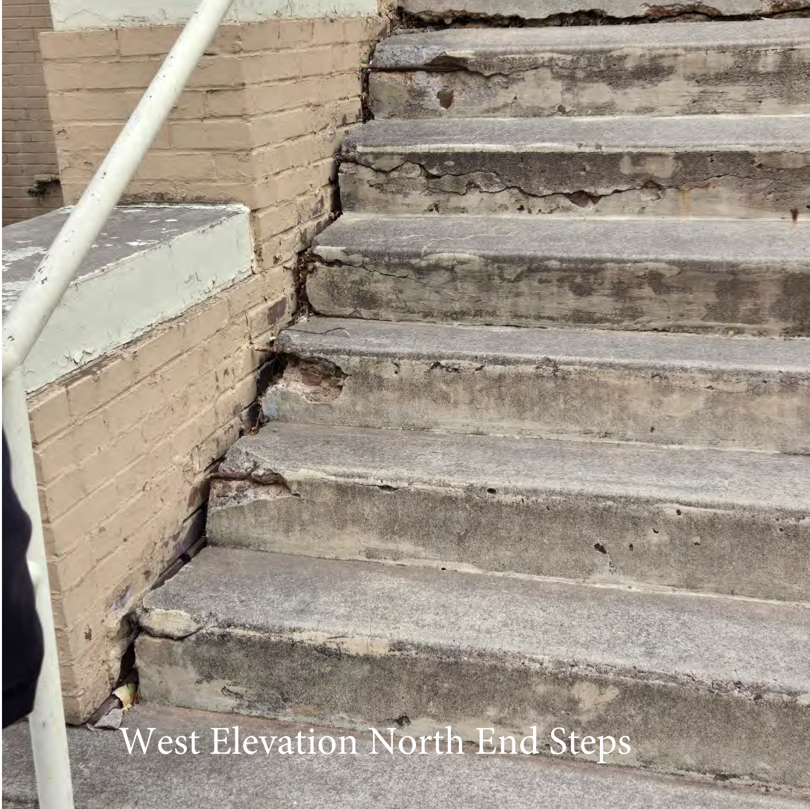
West Elevation North End Steps