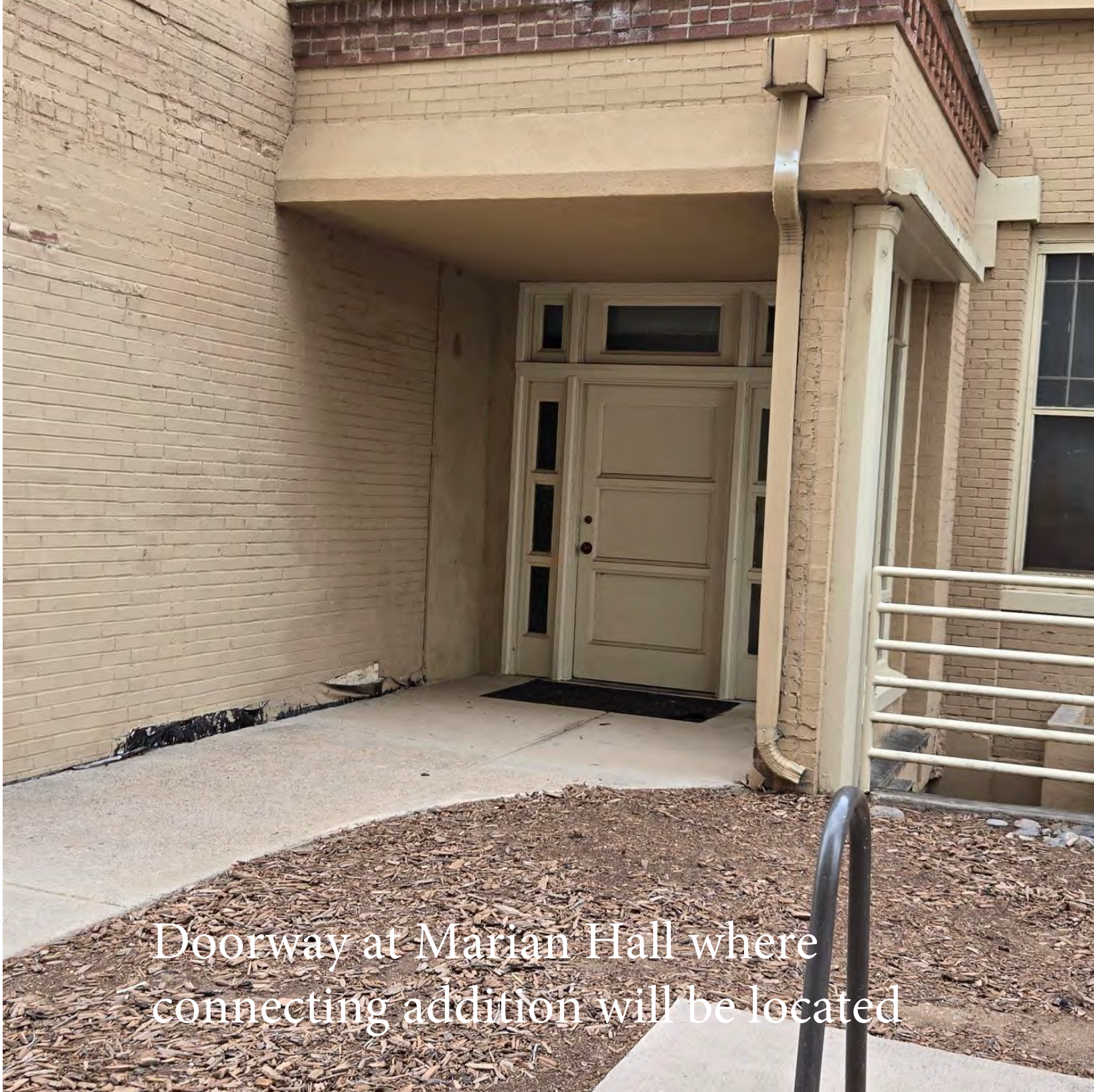
Doorway at Marian Hall where connecting addition will be located