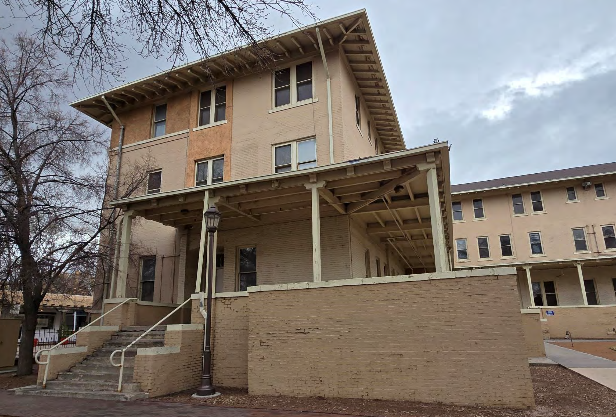
Marian Hall West Elevation