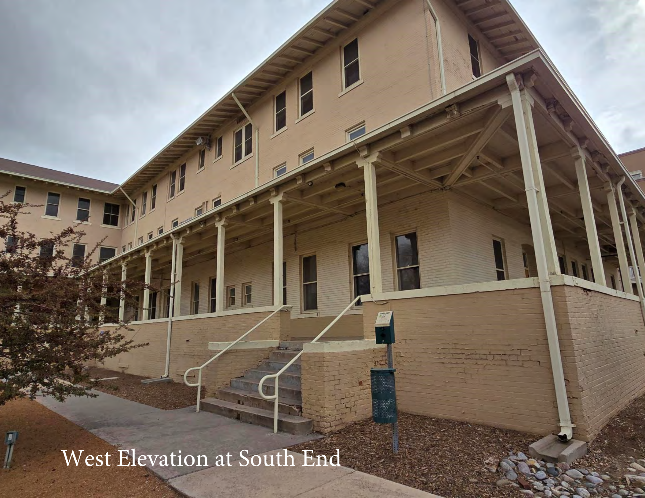
West Elevation at South End