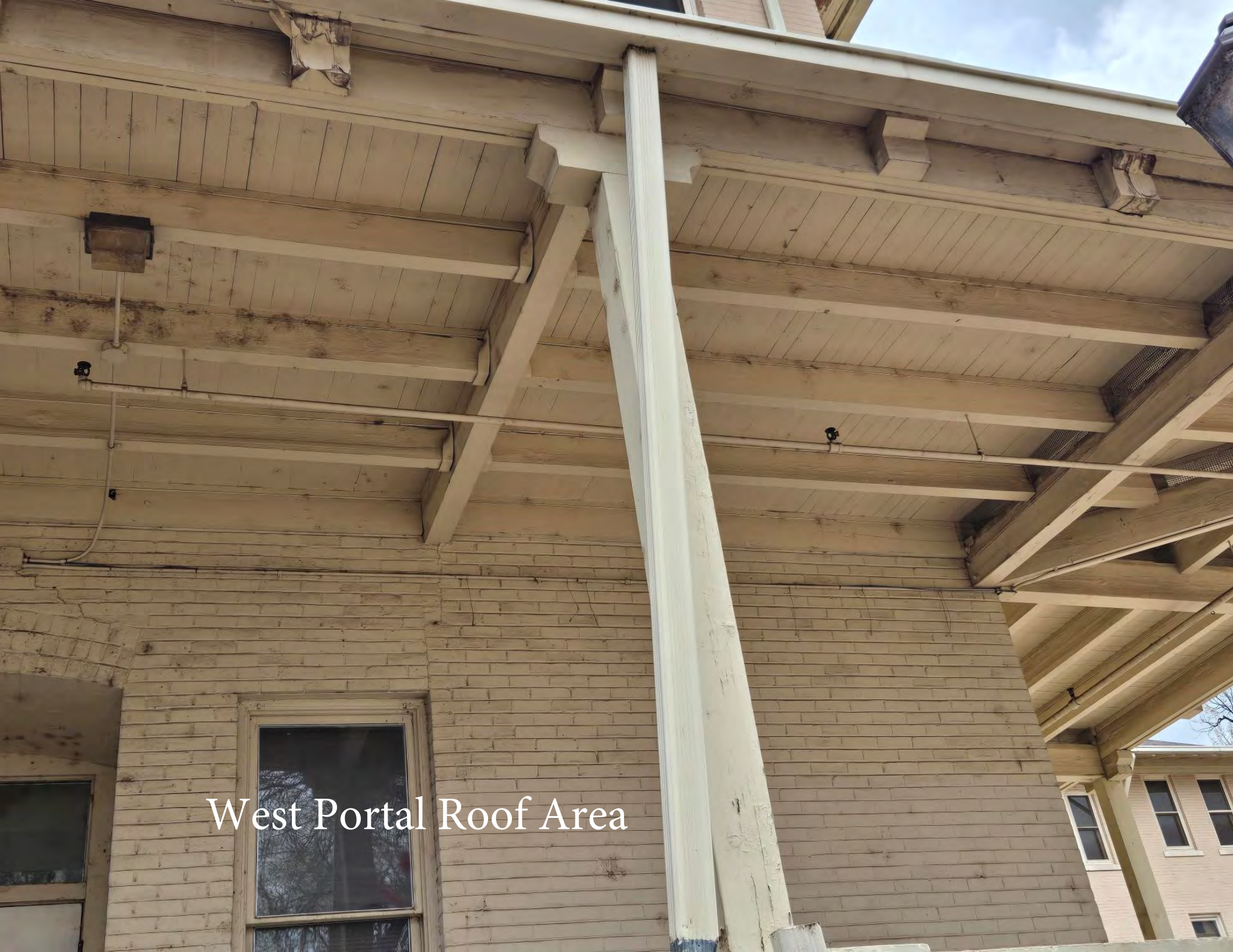
West Portal Roof Area