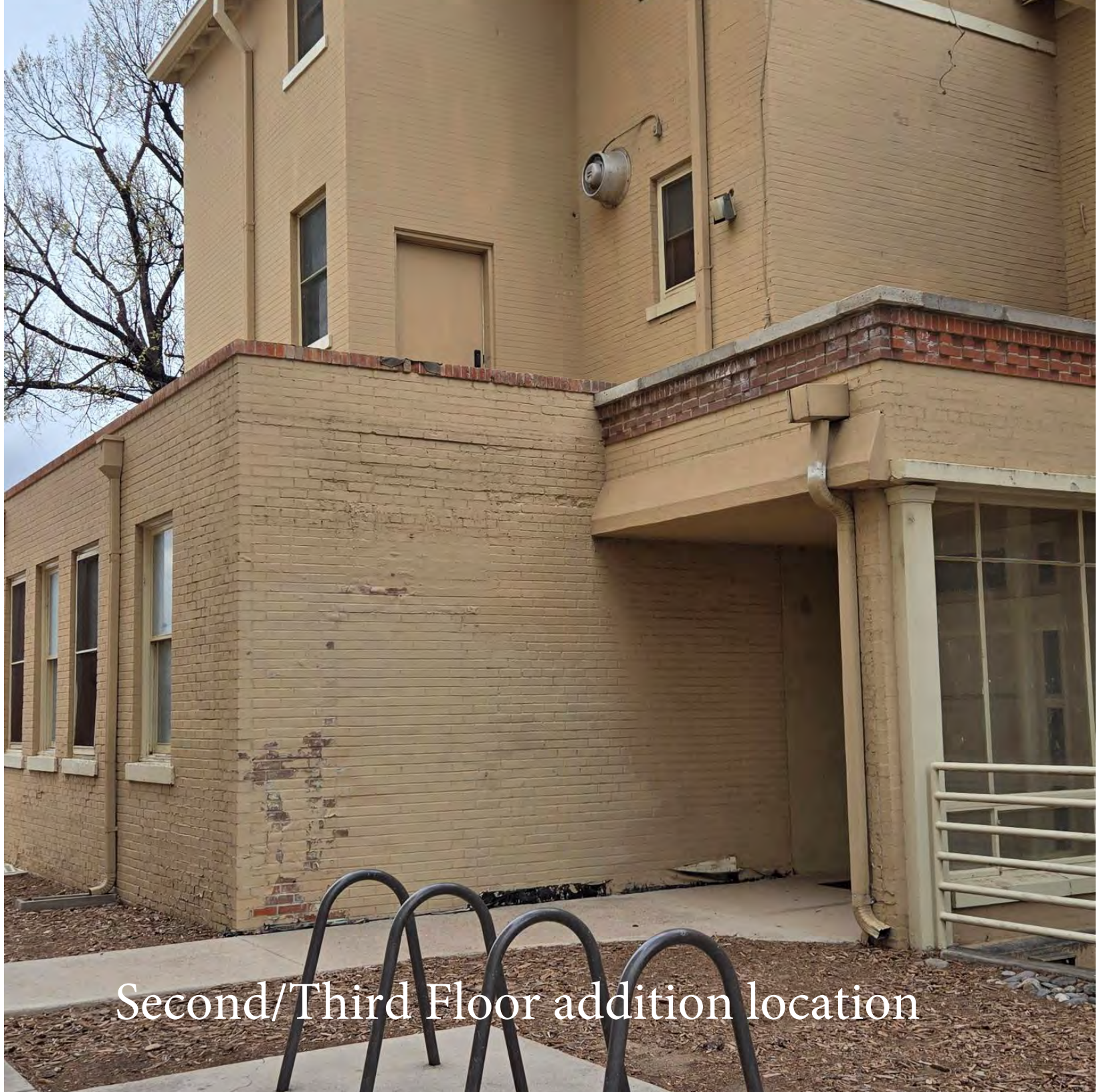
Second/Third Floor addition location