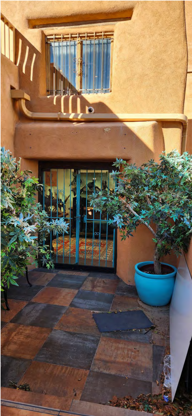
EXISTING EAST ELEVATION AS BUILT REAR NORTH PORTION OF THE BUILDING (POST FIRE DAMAGE)