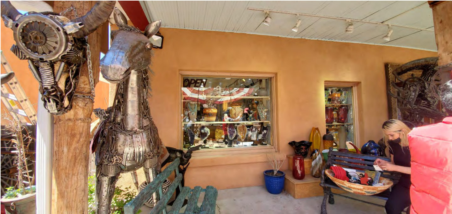
ORIGINAL FRONT PARTIAL EAST ELEVATIONS