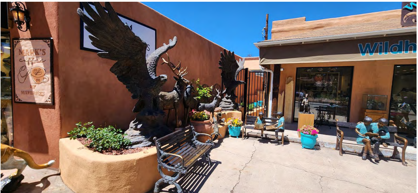
AS BUILT LOW PLANTER WALL AT SOUTH PROPERTY LINE