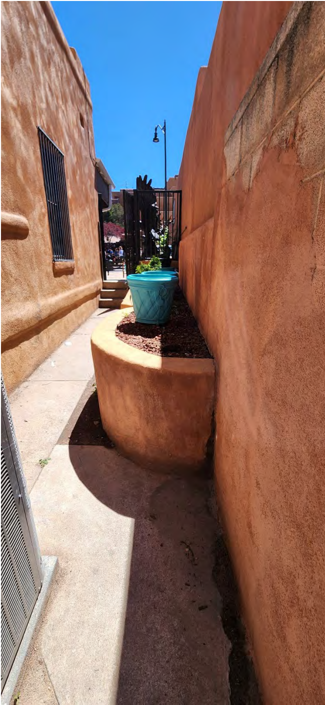
AS BUILT LOW PLANTER WALL AT SOUTH PROPERTY LINE