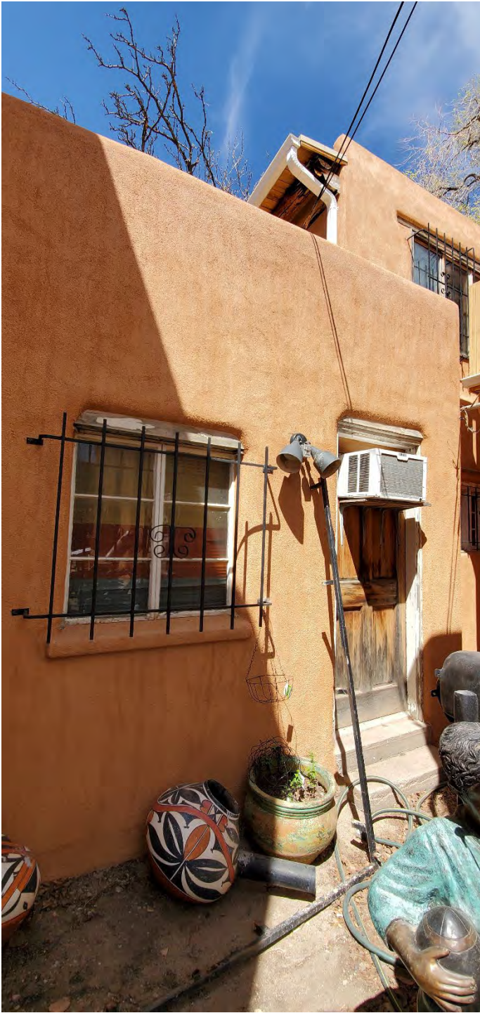
EXISTING EAST ELEVATION REAR SOUTH PORTION OF THE BUILDING (BEFORE FIRE DAMAGE)