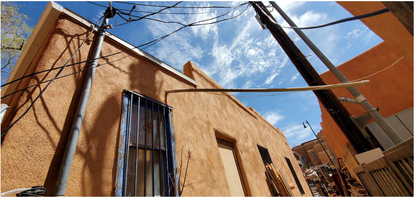
EXISTING GATE TO THE SOUTH ACCESS AREA AND SOUTH PROPERTY LINE WALL