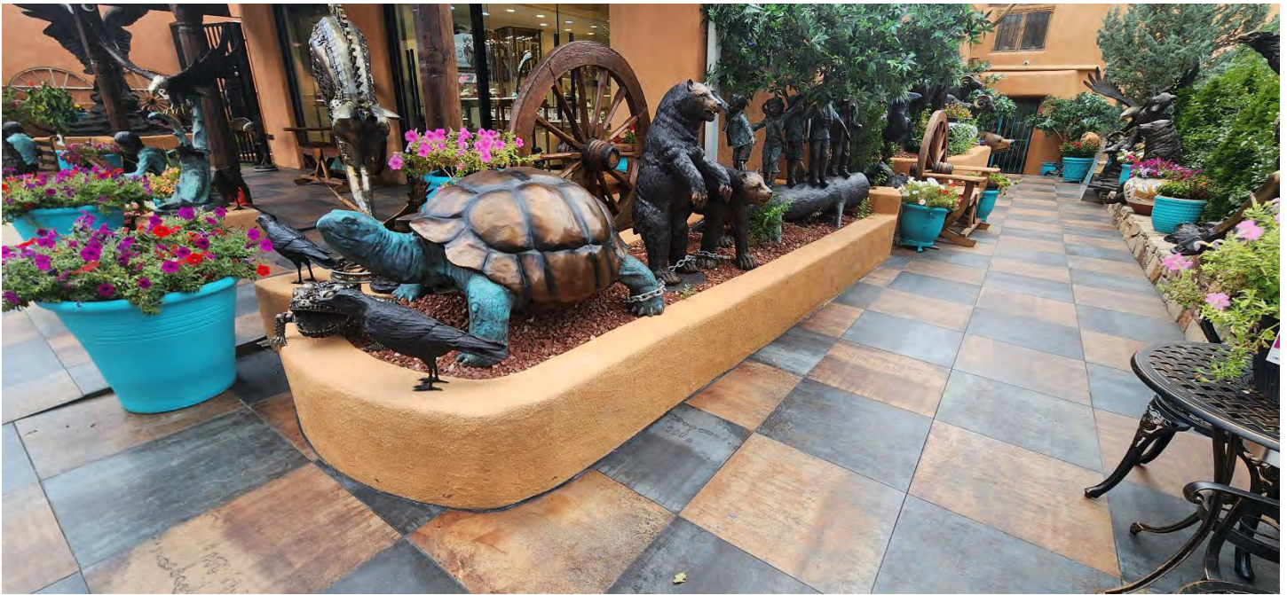
NORTH ELEVATION AS BUILT - LOW PLANTER WALL 2'X2' TILE WALKING SURFACE COVERING