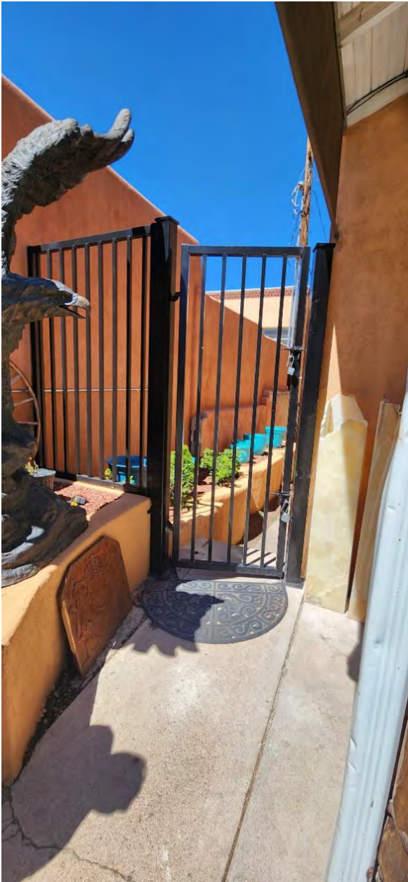
AS BUILT GATE TO THE SOUTH ACCESS AREA