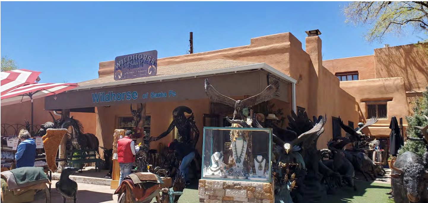
ORIGINAL FRONT EAST ELEVATION