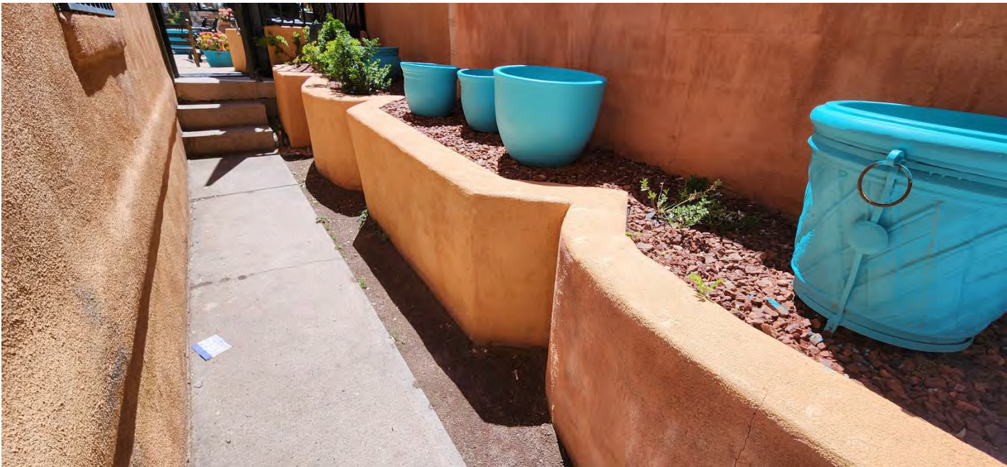
AS BUILT LOW PLANTER WALL AT SOUTH PROPERTY LINE