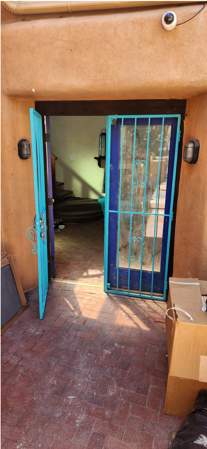
EXISTING EAST ELEVATION REAR NORTH PORTION OF THE BUILDING (BEFORE FIRE DAMAGE)