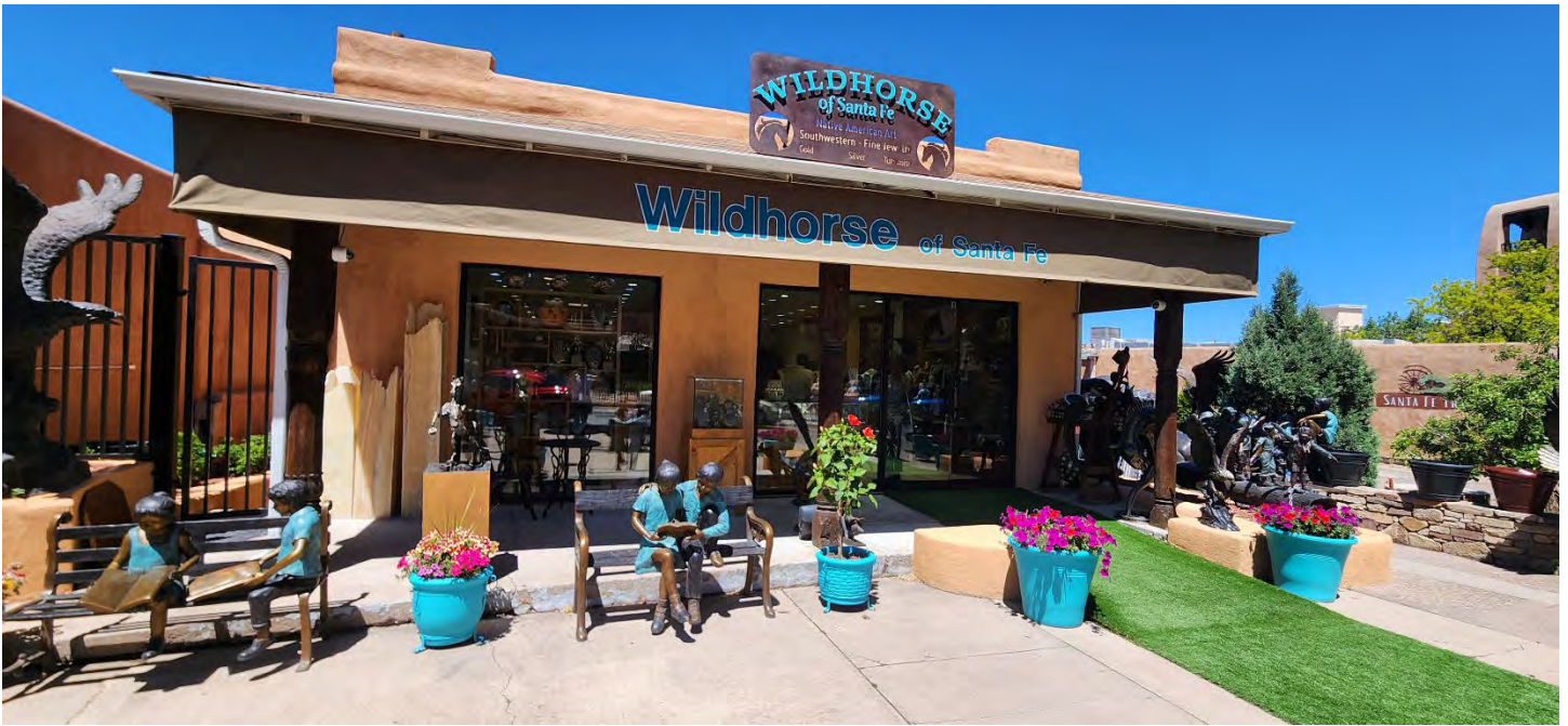
EAST ELEVATION AS BUILT - STOREFRONT