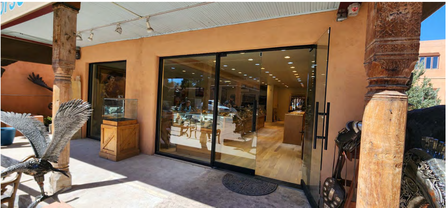
EAST ELEVATION AS BUILT - STOREFRONT