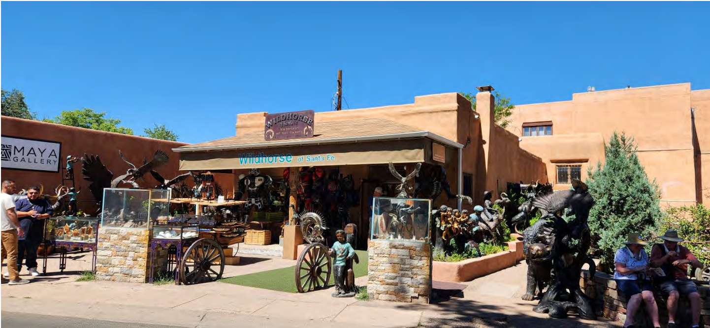
ORIGINAL FRONT EAST ELEVATION