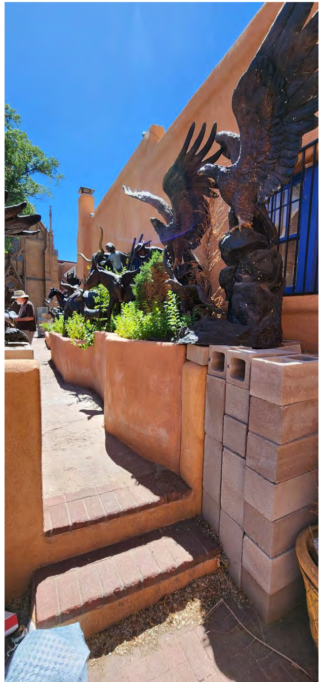
NORTH ELEVATION EXISTING - LOW PLANTER WALL