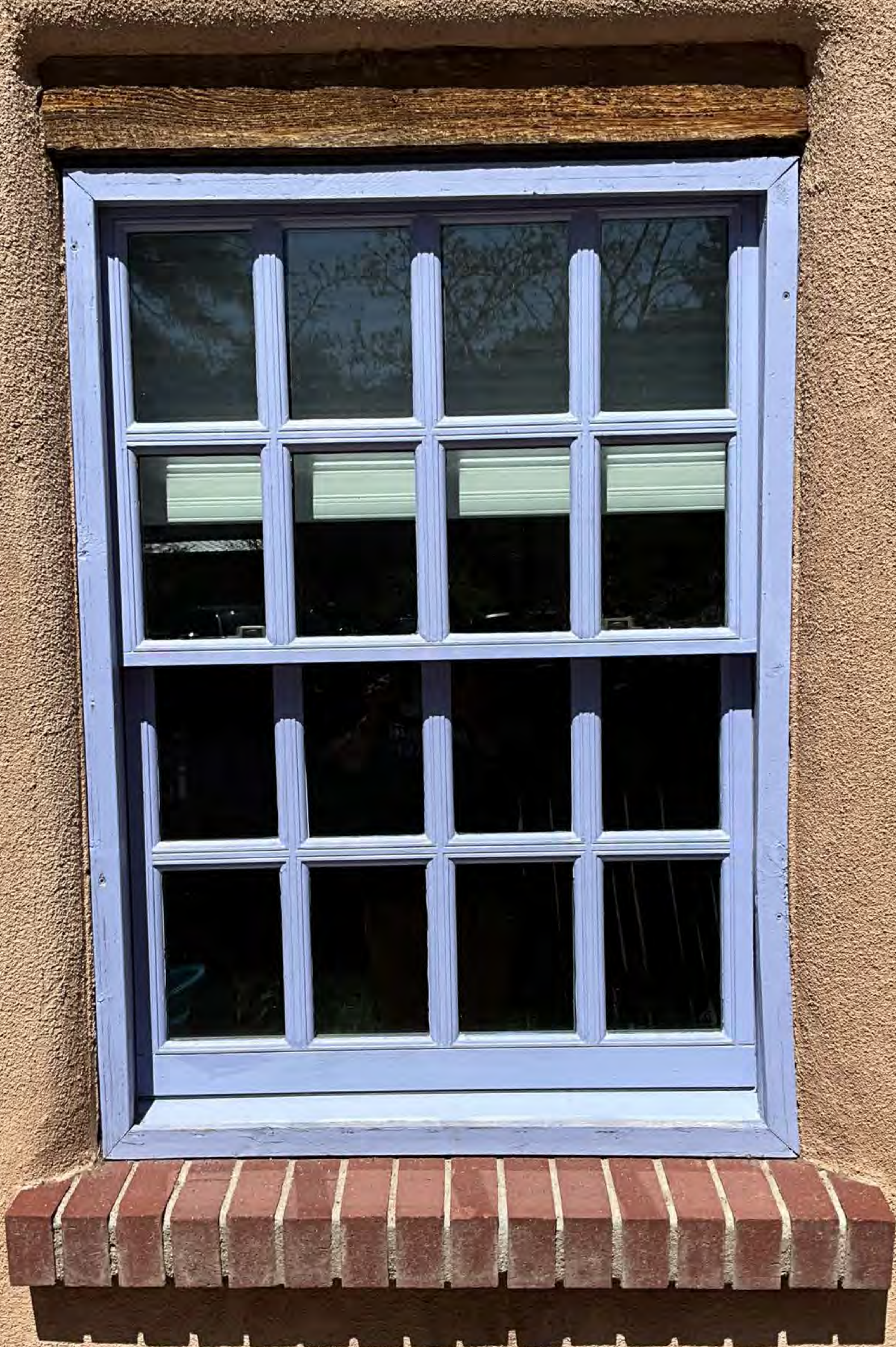
EAST WINDOW A