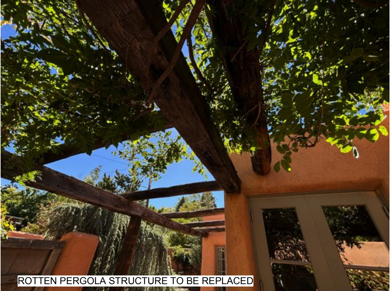
ROTTEN PERGOLA STRUCTURE TO BE REPLACED