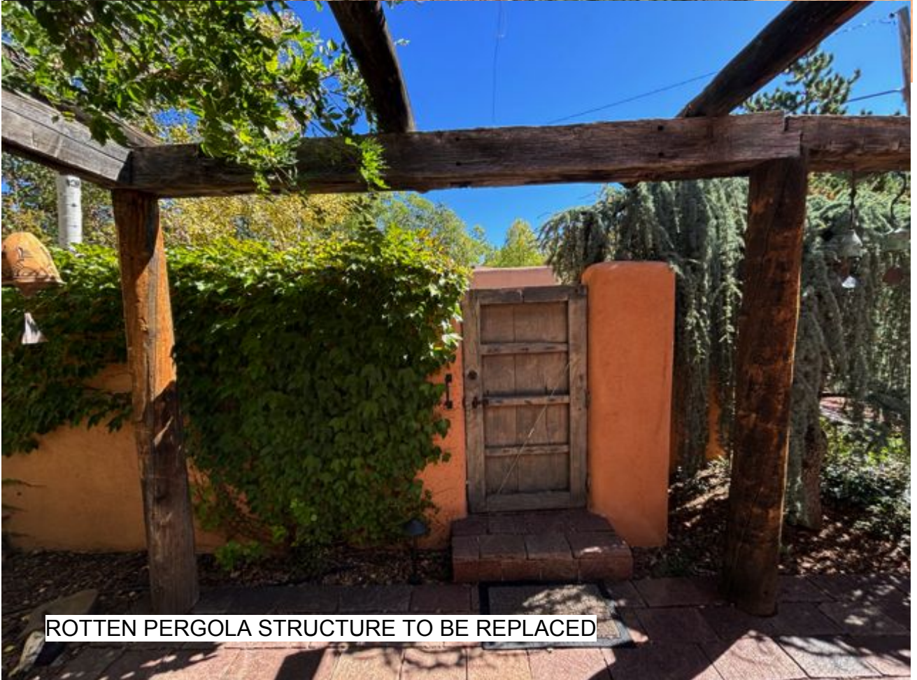
ROTTEN PERGOLA STRUCTURE TO BE REPLACED