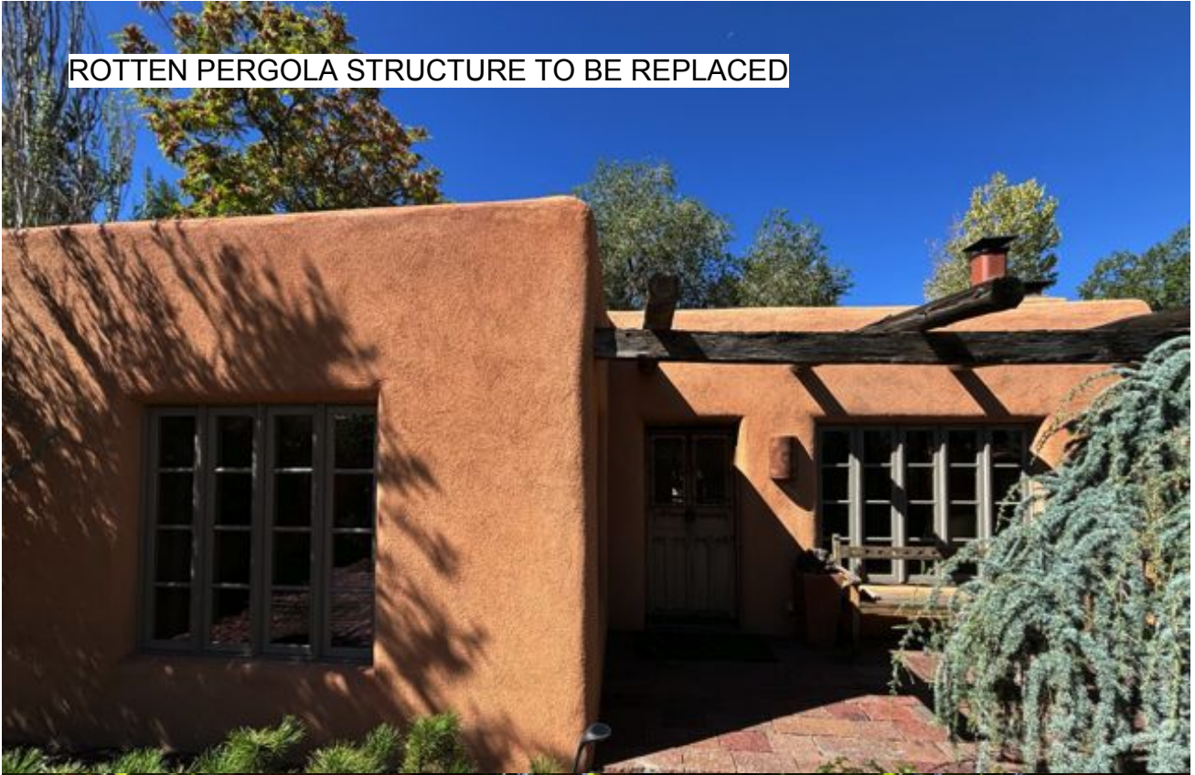
ROTTEN PERGOLA STRUCTURE TO BE REPLACED