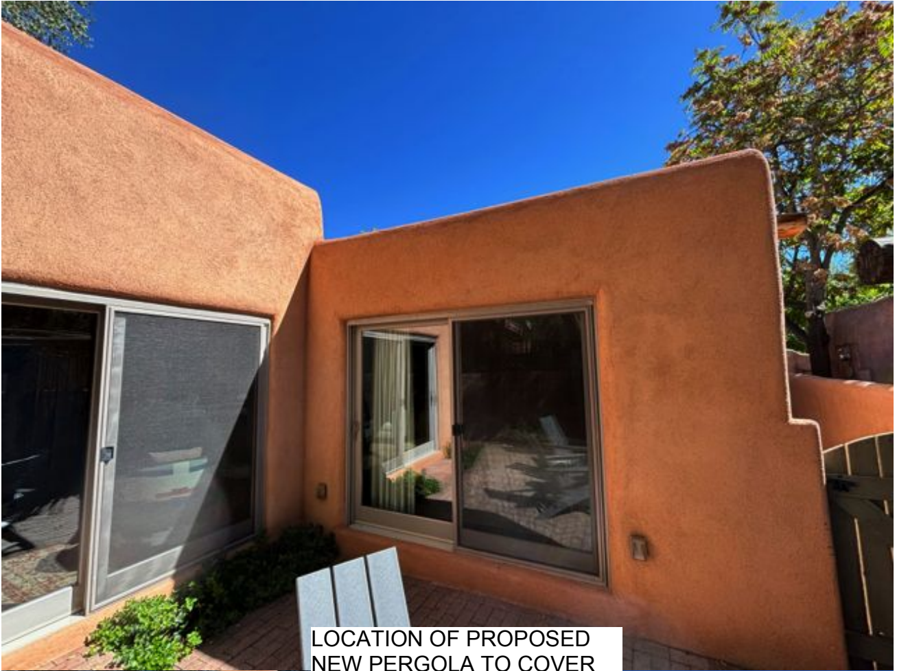
LOCATION OF PROPOSED NEW PERGOLA TO COVER TWO SLIDING GLASS DOORS