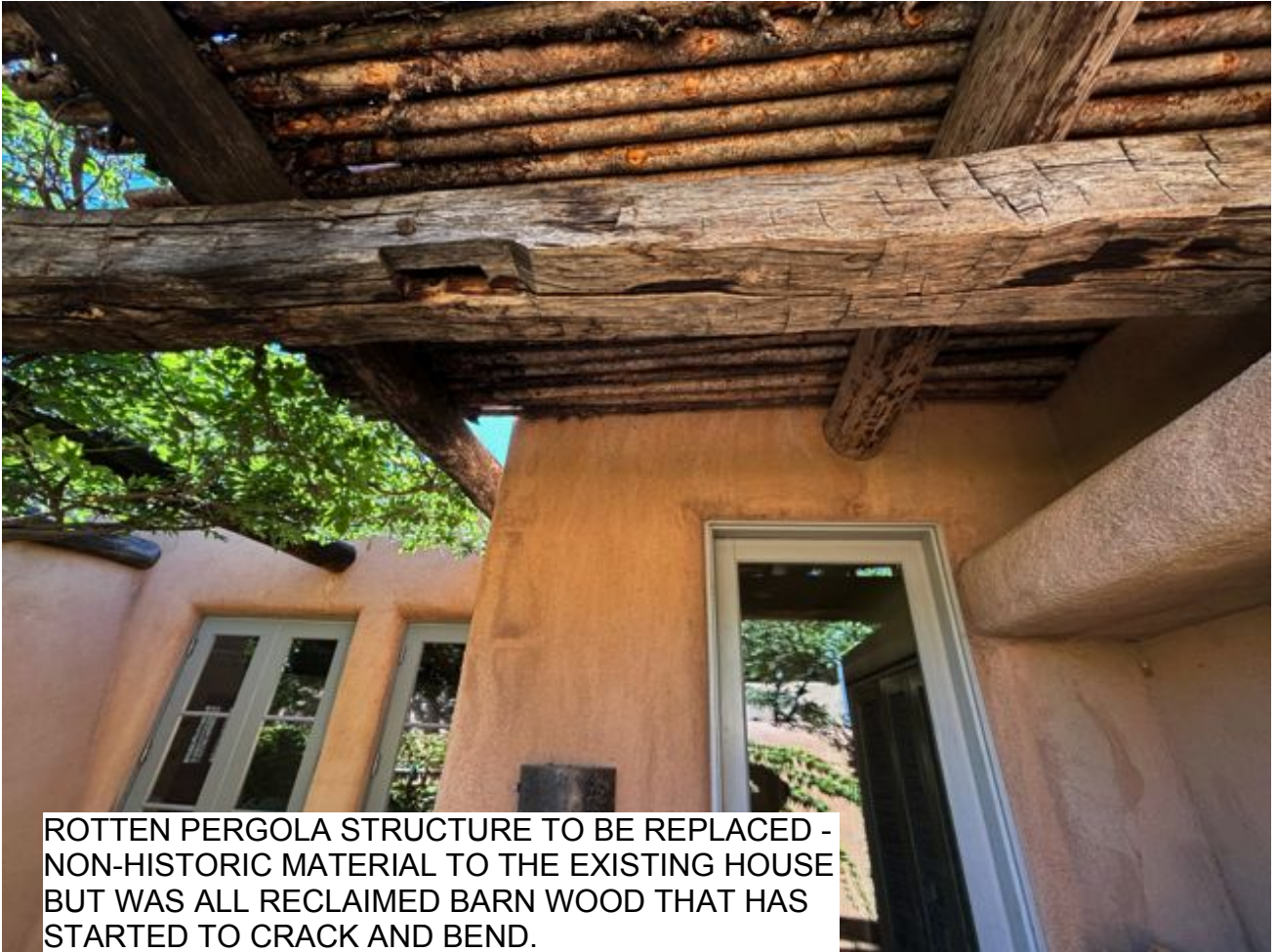
ROTTEN PERGOLA STRUCTURE TO BE REPLACED - NON-HISTORIC MATERIAL TO THE EXISTING HOUSE BUT WAS ALL RECLAIMED BARN WOOD THAT HAS STARTED TO CRACK AND BEND.