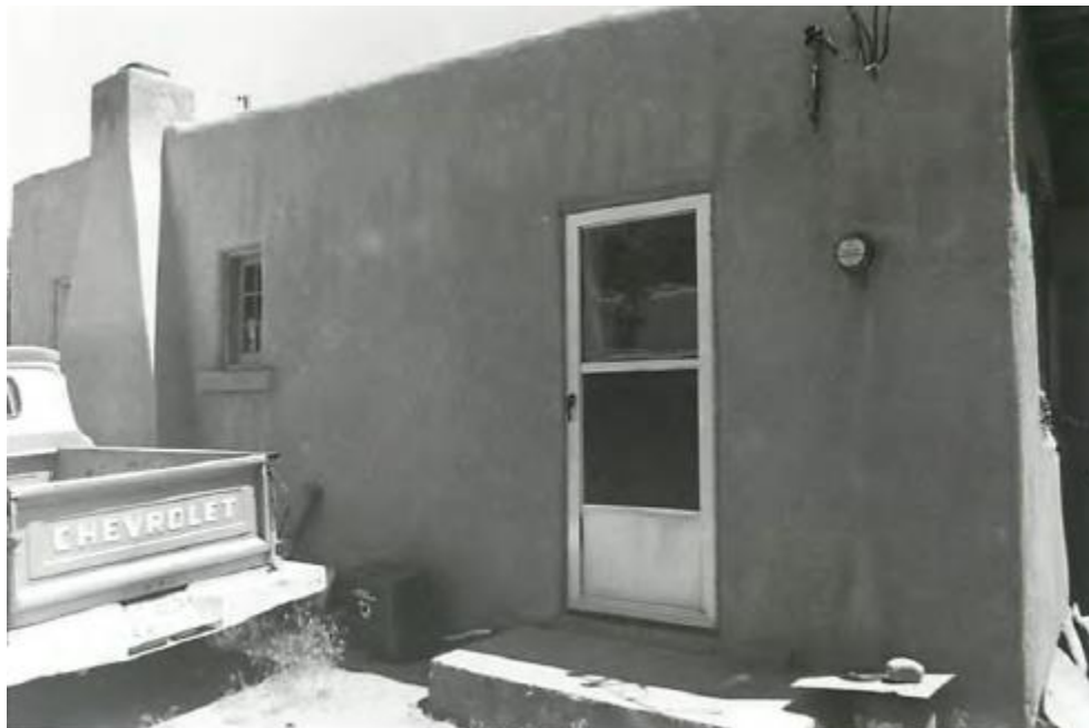
#24 east portion of north elevation

The structure has now been enveloped from alterations from 2002 and 2005. The main structure does have elements of the original construction, and some are evident on the east portion of the north elevation. With the current request and previous alterations to the structure there is a minimal historic presence on the streetscape.