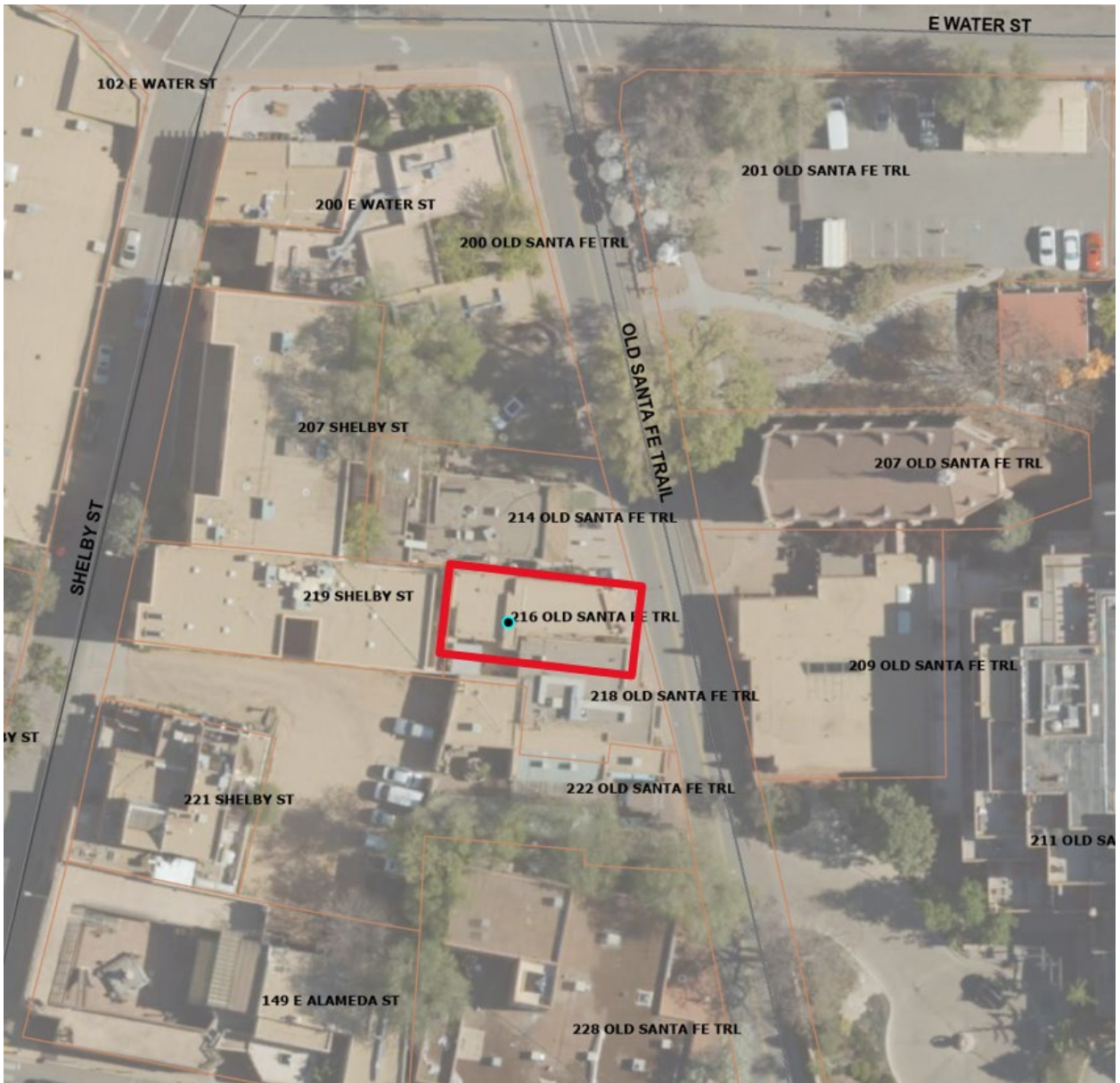
Figure 1: Property location

The commercial structure located at 216 Old Santa Fe Trail is a non-contributing structure located in the Downtown and Eastside Historic District. The Board designated the structure as non-contributing under case 2024-008452-HDRB in June of 2024.