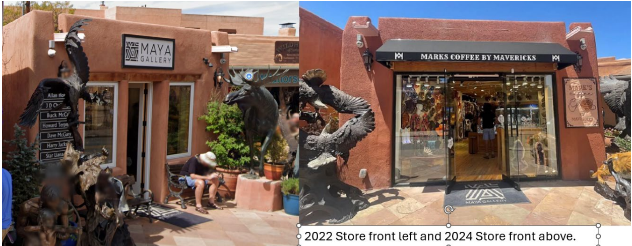
Figure 3: Store fronts in 2022 and 2024

The applicant received a stop work order (red tag) in February of 2024 for creating the glass front, installing the awning, and replacing signs without a permit.