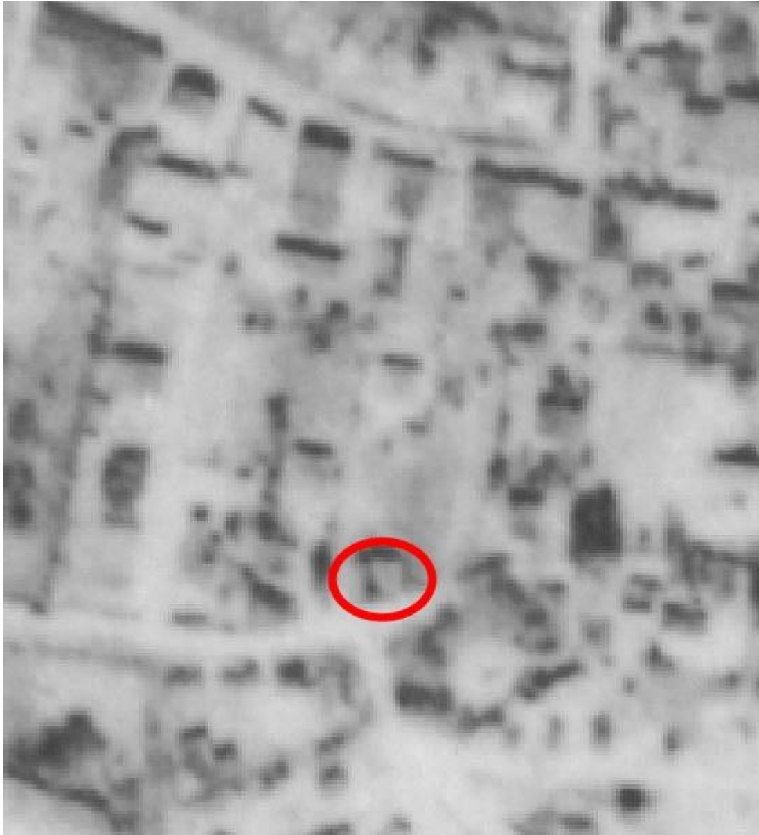
Figure 2: October 25, 1948, aerial photograph. Highlighted structure may be the current house.