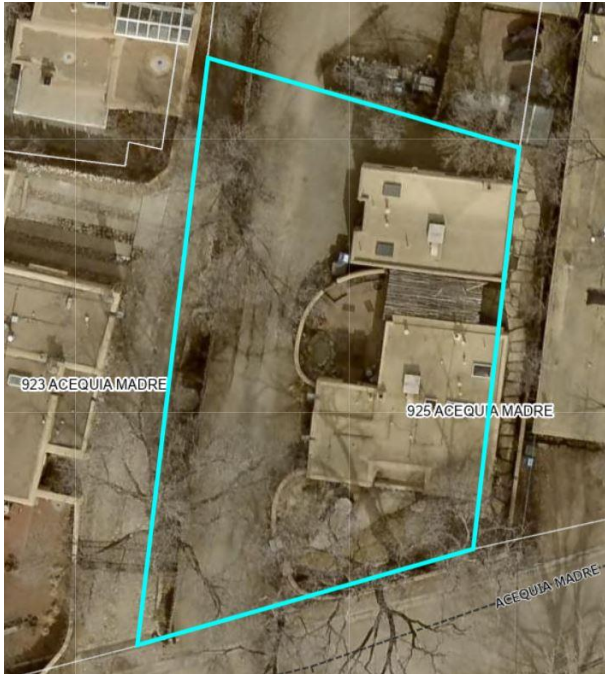
parcel lines are not accurate