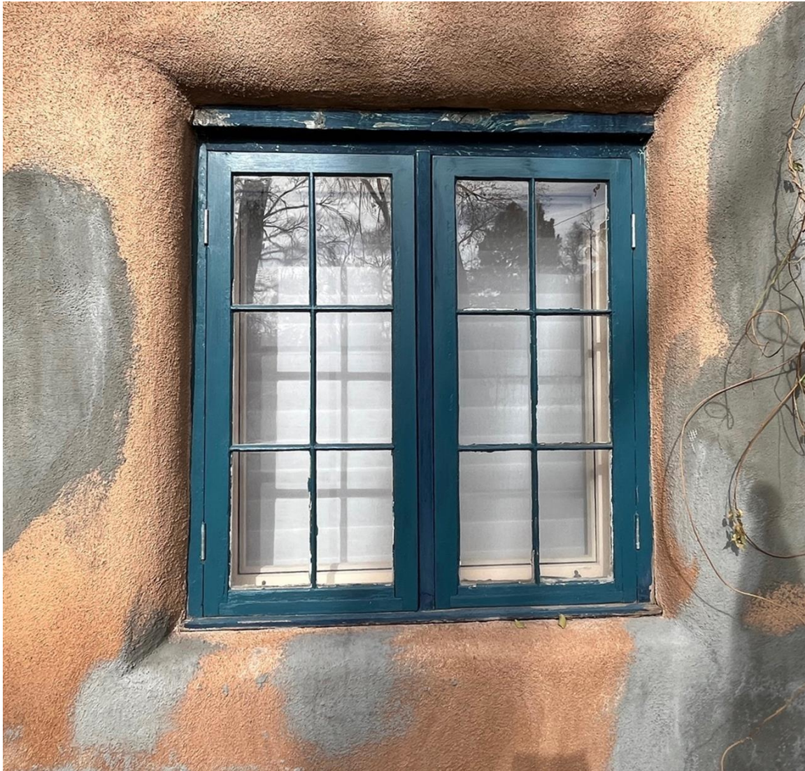
Photo 3: South (front) elevation. West window. Camera facing north.