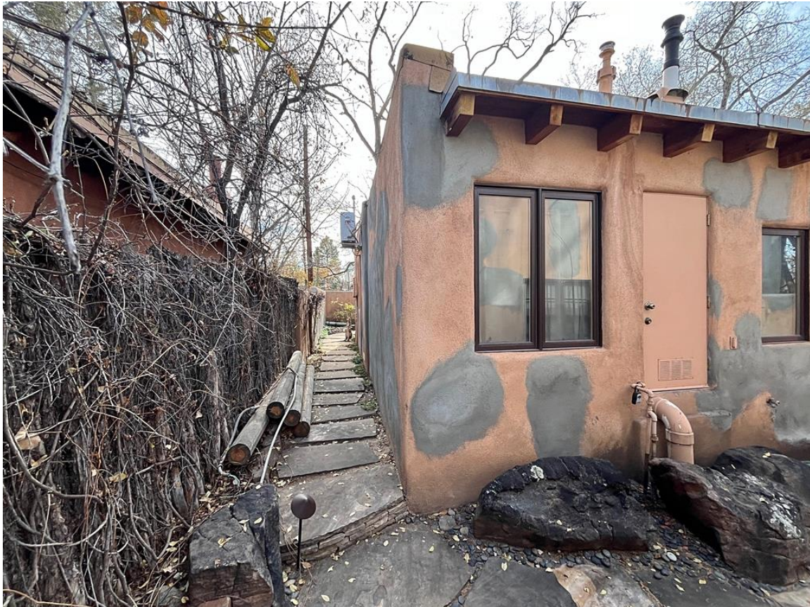
Photo 8: North elevation. Northeast corner. Camera facing southwest.