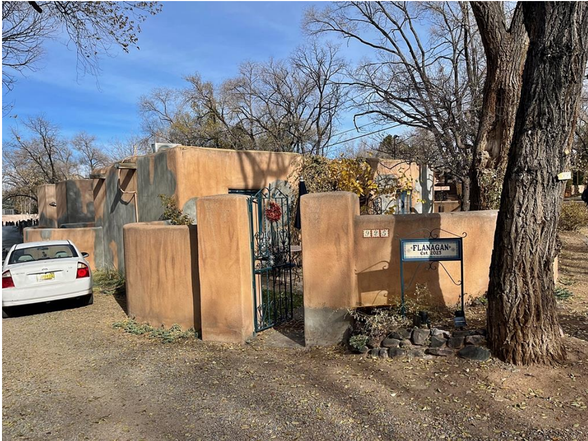
Photo 13: Entry gate and curved wall. Camera facing northeast. Note gate and wall were erected in c.2002.