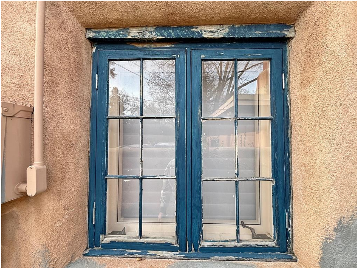
Photo 7: East elevation. Window. Note geared crank-out hardware. Camera facing west.