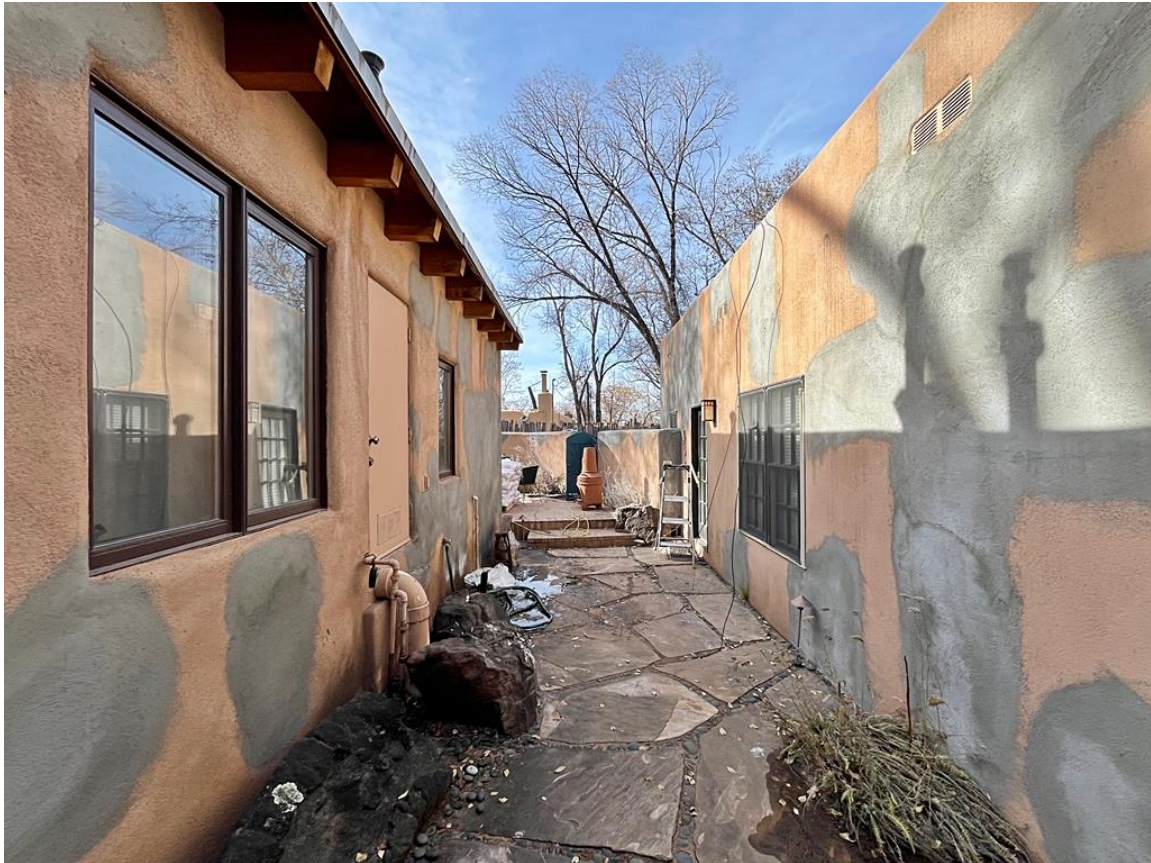
Photo 9: North elevation oblique. 2003 guesthouse at right. Camera facing west.