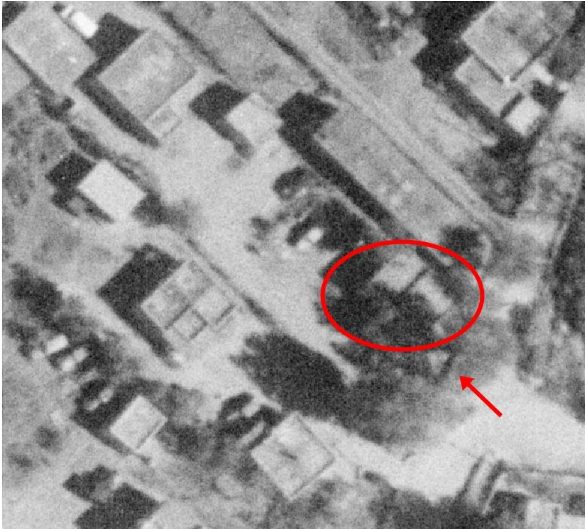
Figure 3: November 10, 1958, aerial photograph. Note presence of lower north addition and street wall, indicated by an arrow.