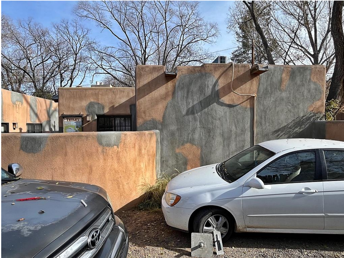
Photo 12: West elevation. Camera facing east. Note curved wall was constructed in c.2002.