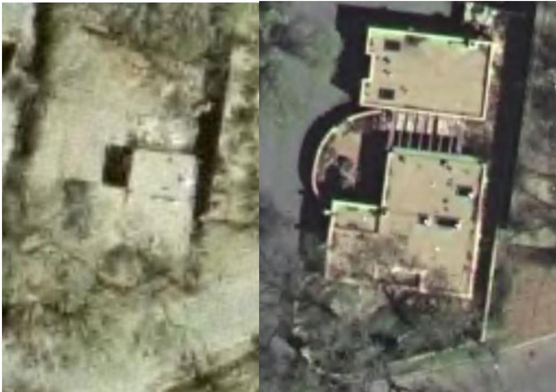
Figure 7: 2001 (left) and 2005 (right) aerial photographs. Note the introduction of curved privacy walls in the 2005 image.