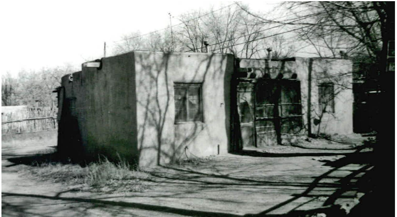
Figure 6: November 14, 1984, HBI survey photograph.