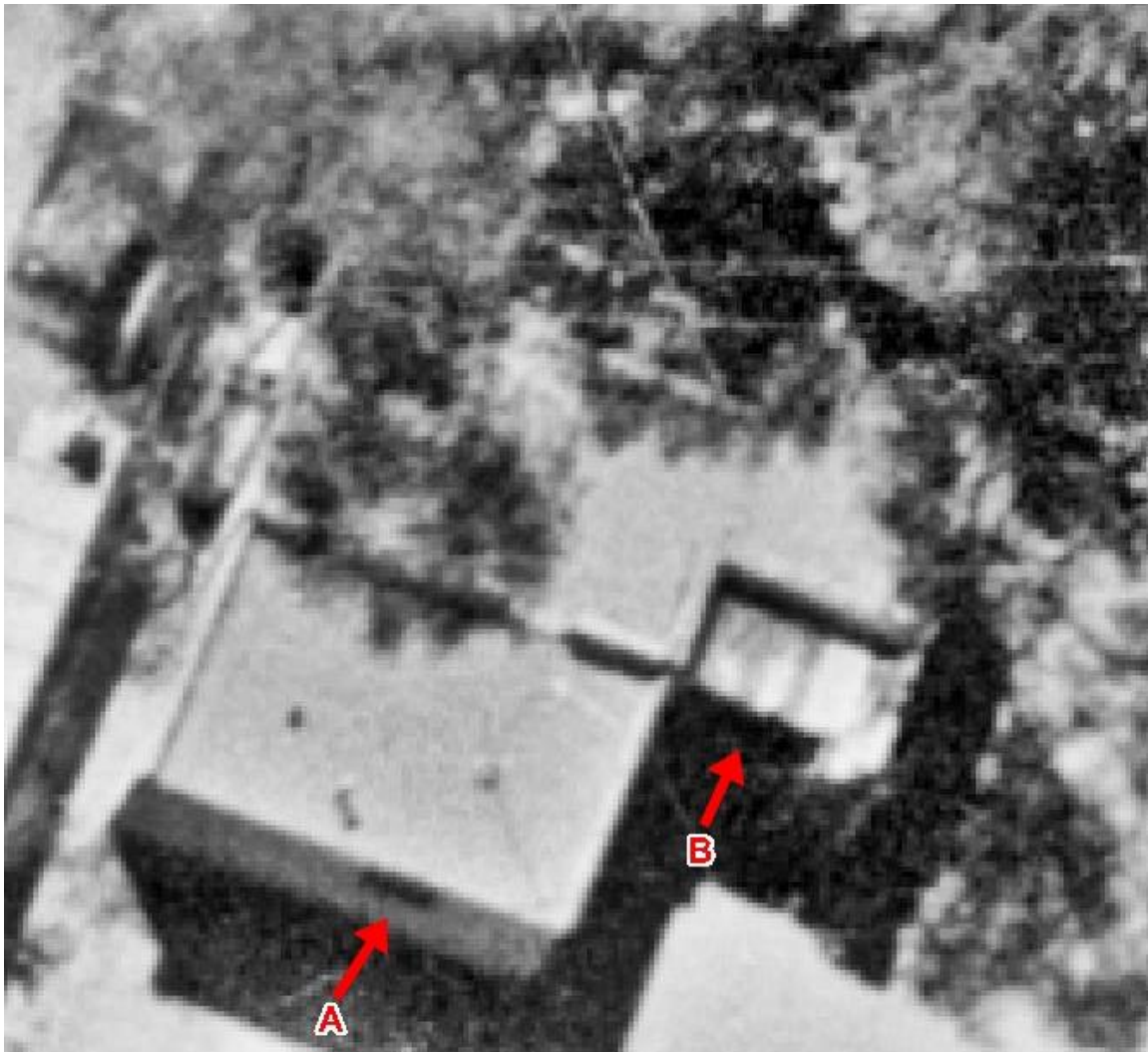
Figure 5: September 11, 1978, aerial photograph, direction reversed. Note opening closer to west edge of building (A) and what appears to be an open porch (B).