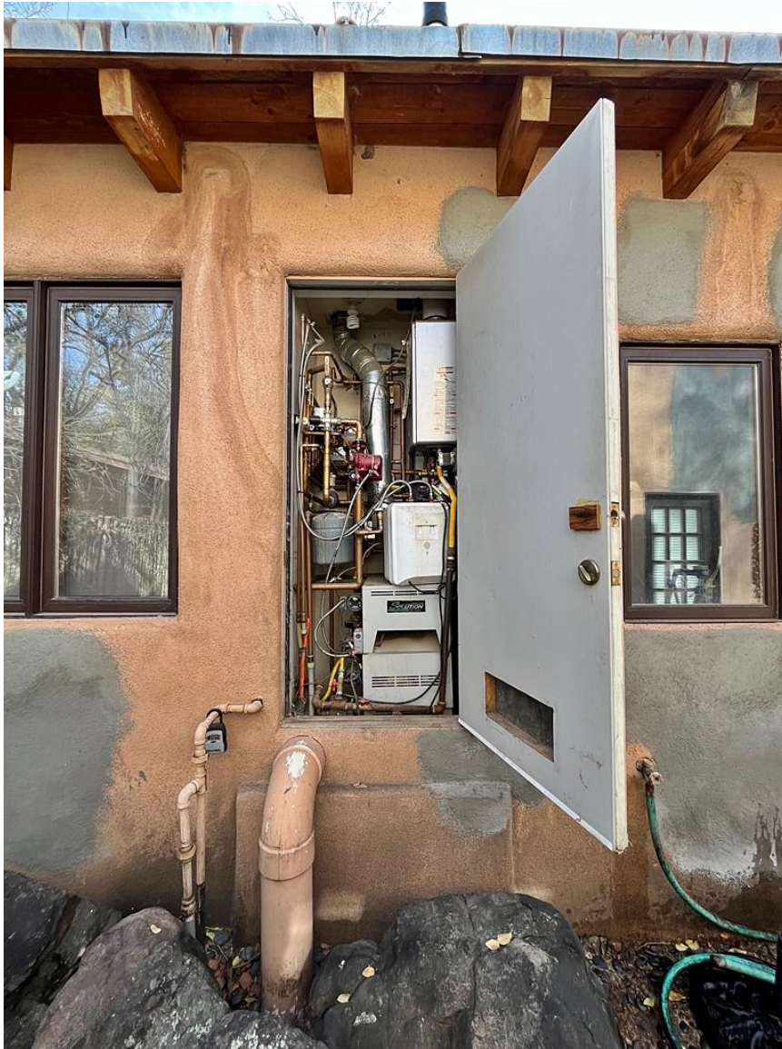
Photo 10: North elevation. Mechanical room entry. Camera facing south.