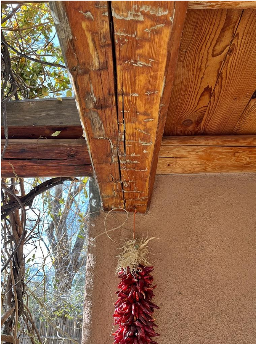
Photo 5: South (front) elevation. Recessed portal decking and beam. Camera facing up.