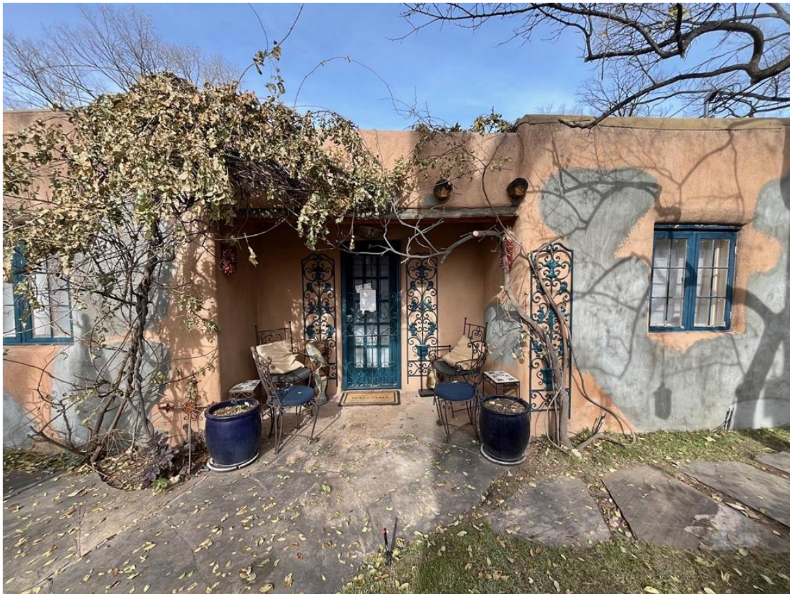
Photo 4: South (front) elevation. Recessed portal. Camera facing north.