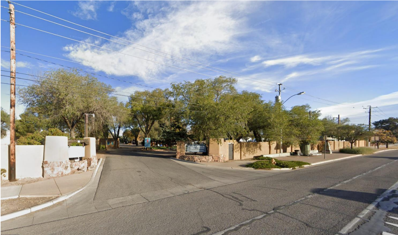
STREET VIEW (Southwest)