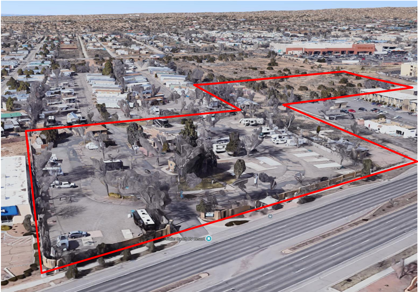
Figure 1: Development Area (boundary for illustrative purposes only)