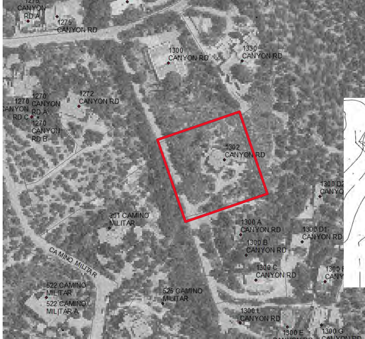
1302 Canyon Road 1992 Aerial compared to current