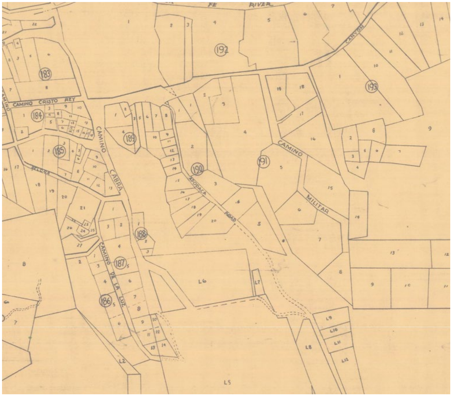
1957 Scanlon Map