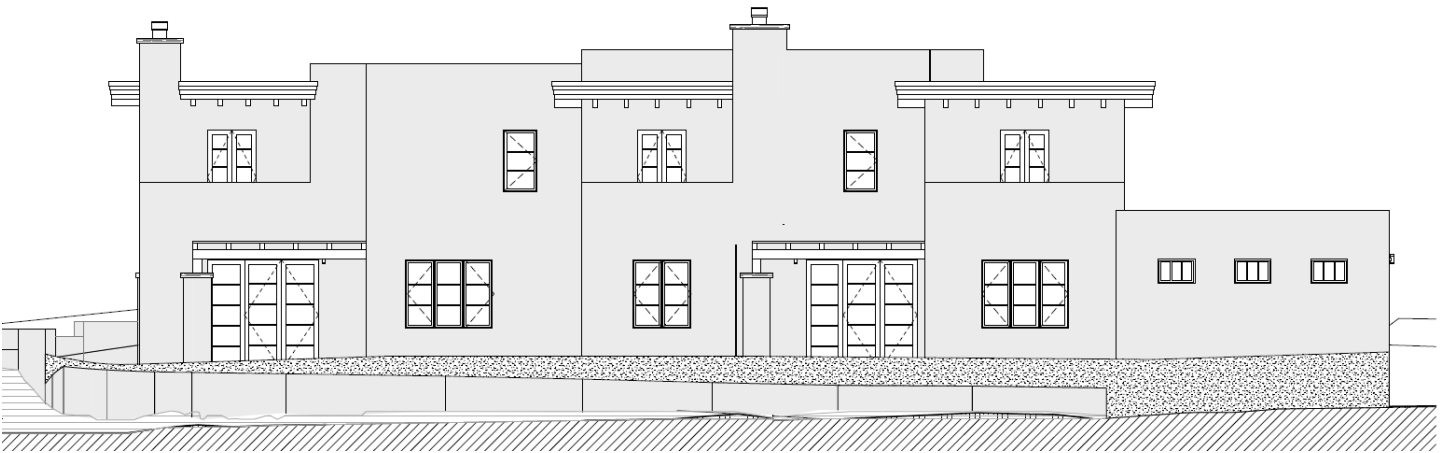
Figure 6: Proposed South Elevation