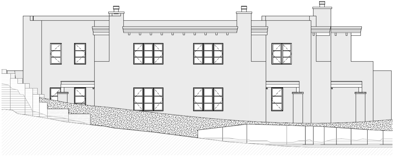
Figure 7: Proposed West Elevation