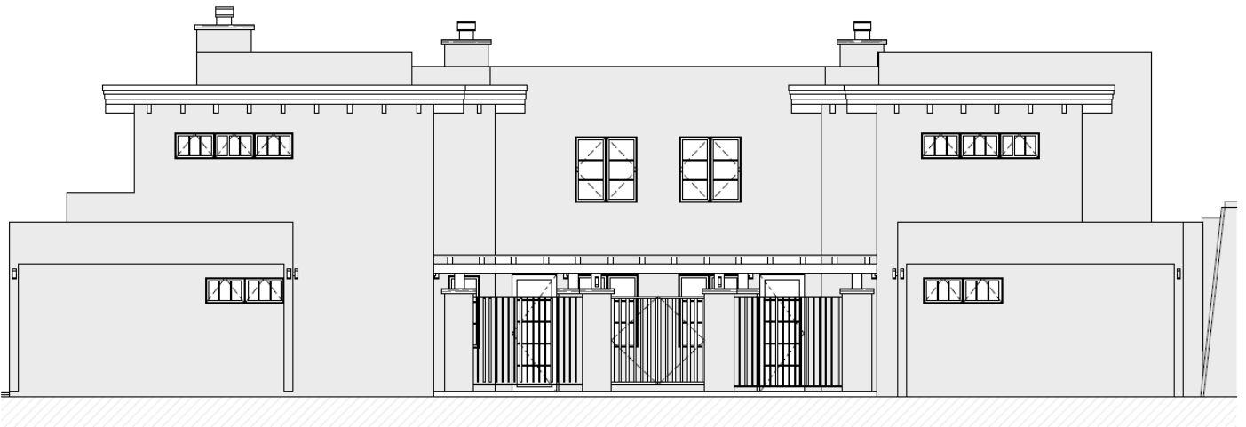
Figure 5: Proposed East Elevation