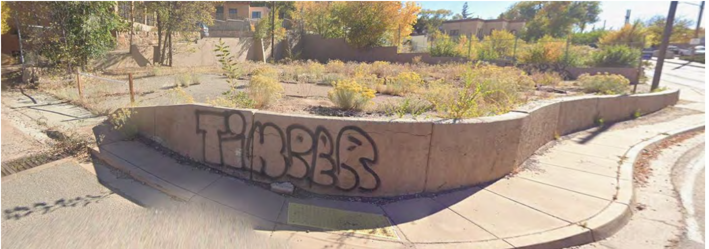
Figure 2: 507 Paseo de Peralta

The property is located at the northeast corner of Paseo de Peralta and Magdalena Road. The subject property is a vacant asphalt parking lot. There are existing retaining walls along the north and east property lines and short retaining walls on the southwest property.