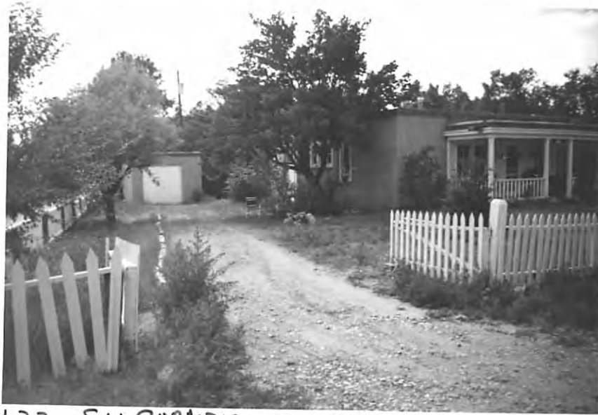
# 33 SW CORNER